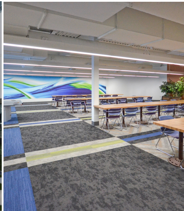
300/400 LOBBY RENOVATION