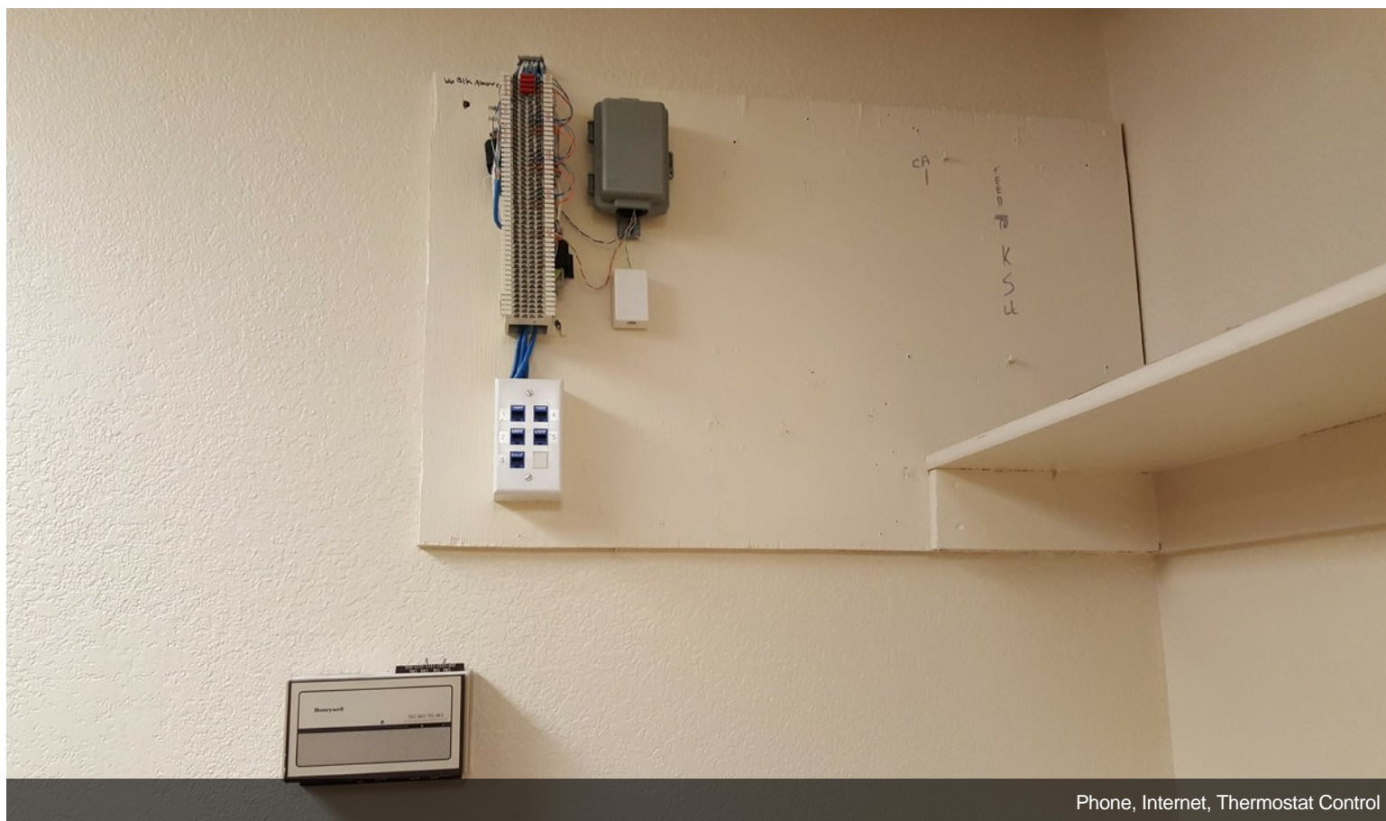
Phone, Internet, Thermostat Control