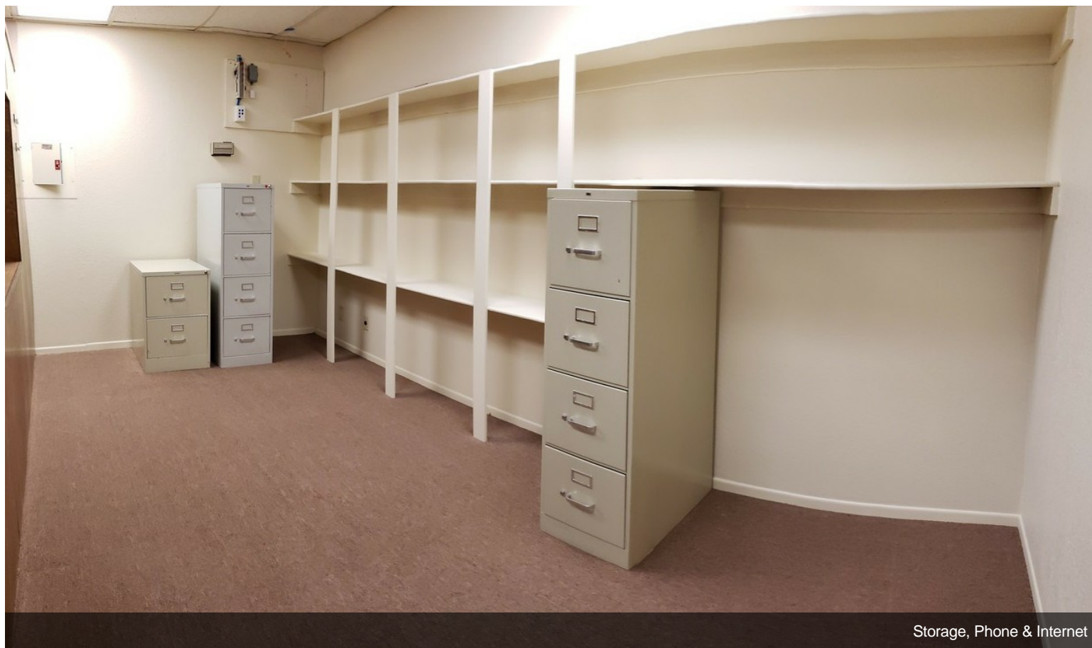
Storage, Phone & Internet