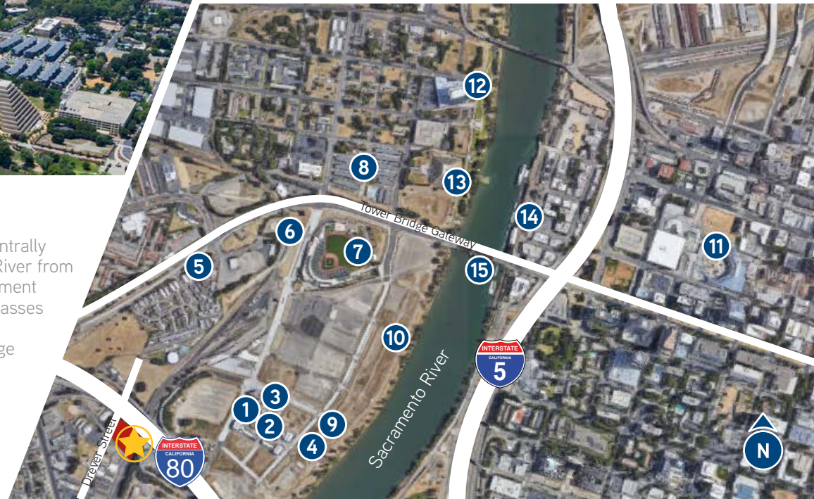
FROM LEFT TO RIGHT: Tower Bridge, Aerial view of West Sacramento

West Sacramento is a vibrant riverfront community centrally located in Northern California, across the Sacramento River from the City of Sacramento's Central Business and Entertainment Districts. Incorporated in 1987, West Sacramento encompasses approximately 22 square miles, with a population just over 51,000 people. Currently, the riverfront area called the Bridge District is rapidly developing. At full build out, there will be 4,000 residential housing units in this area along with offices and retail. Raley Field, home of the River Cats, the AAA affiliate of the San Francisco Giants, anchors the area. Plans are underway for a streetcar line that will connect the city's core with the Bridge District and state capital Sacramento.