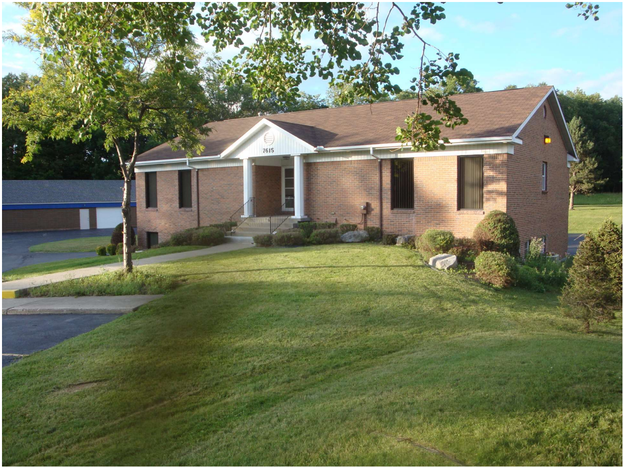
7615 Seneca Front