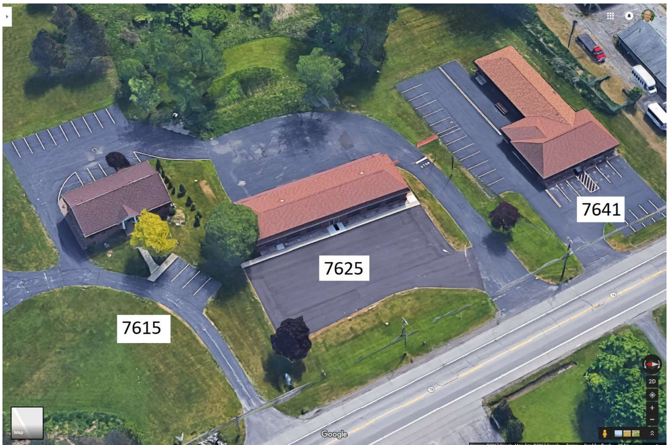
7615, 7625, 7641 Seneca St Offices Front