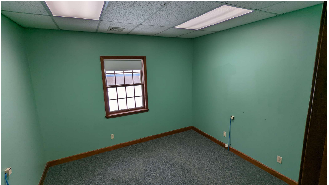
Upper Private Office - Conference Room