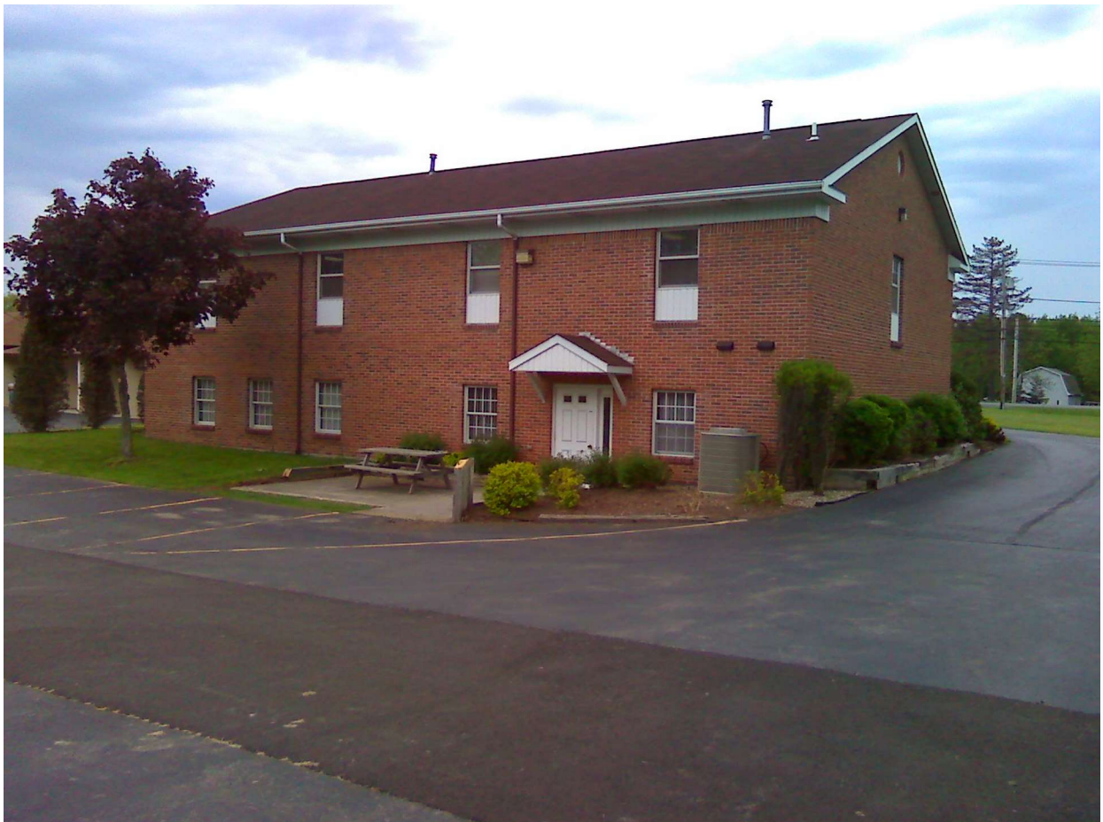
7615 Seneca Rear