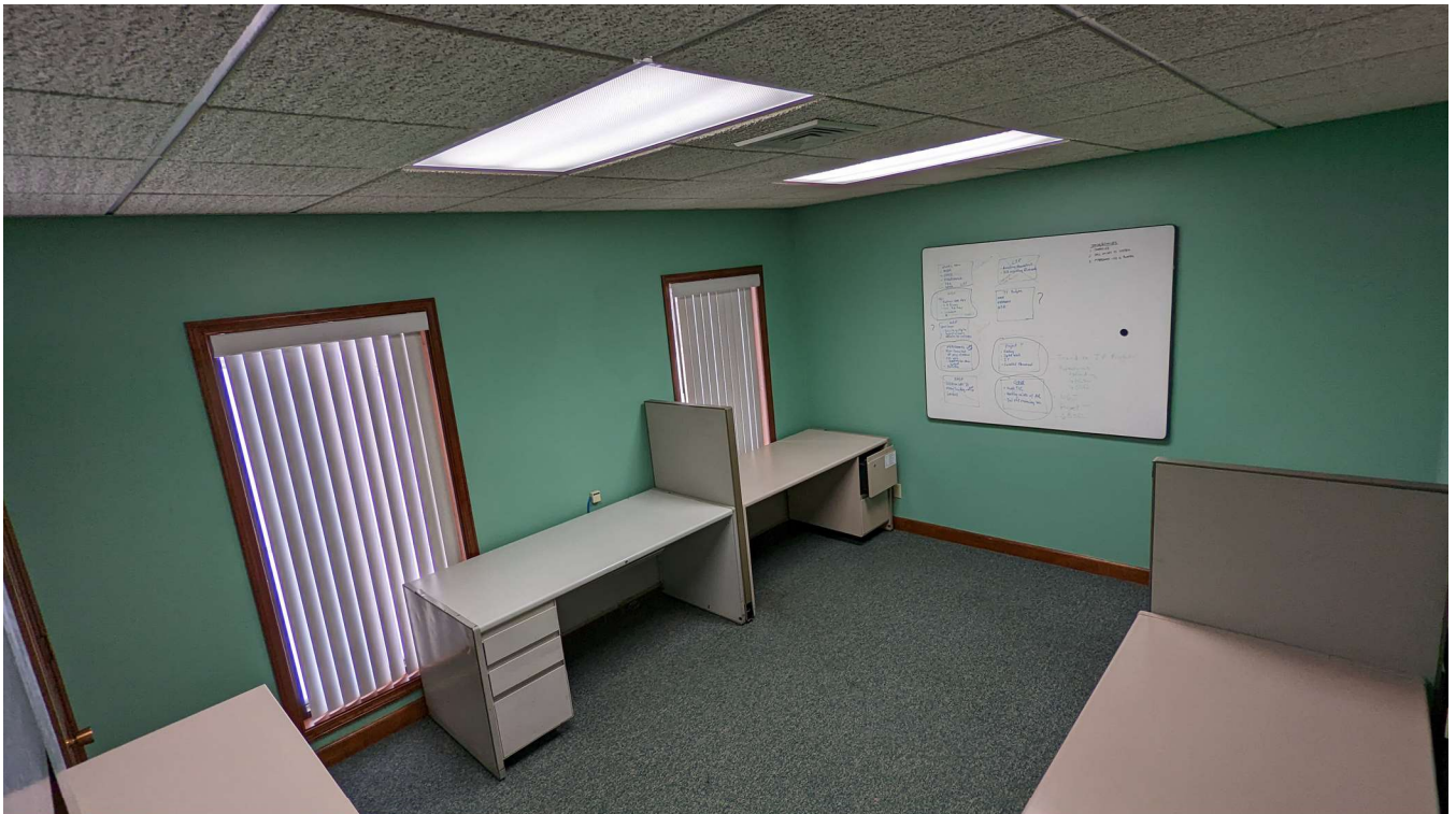
Upper Private Office - Conference Room