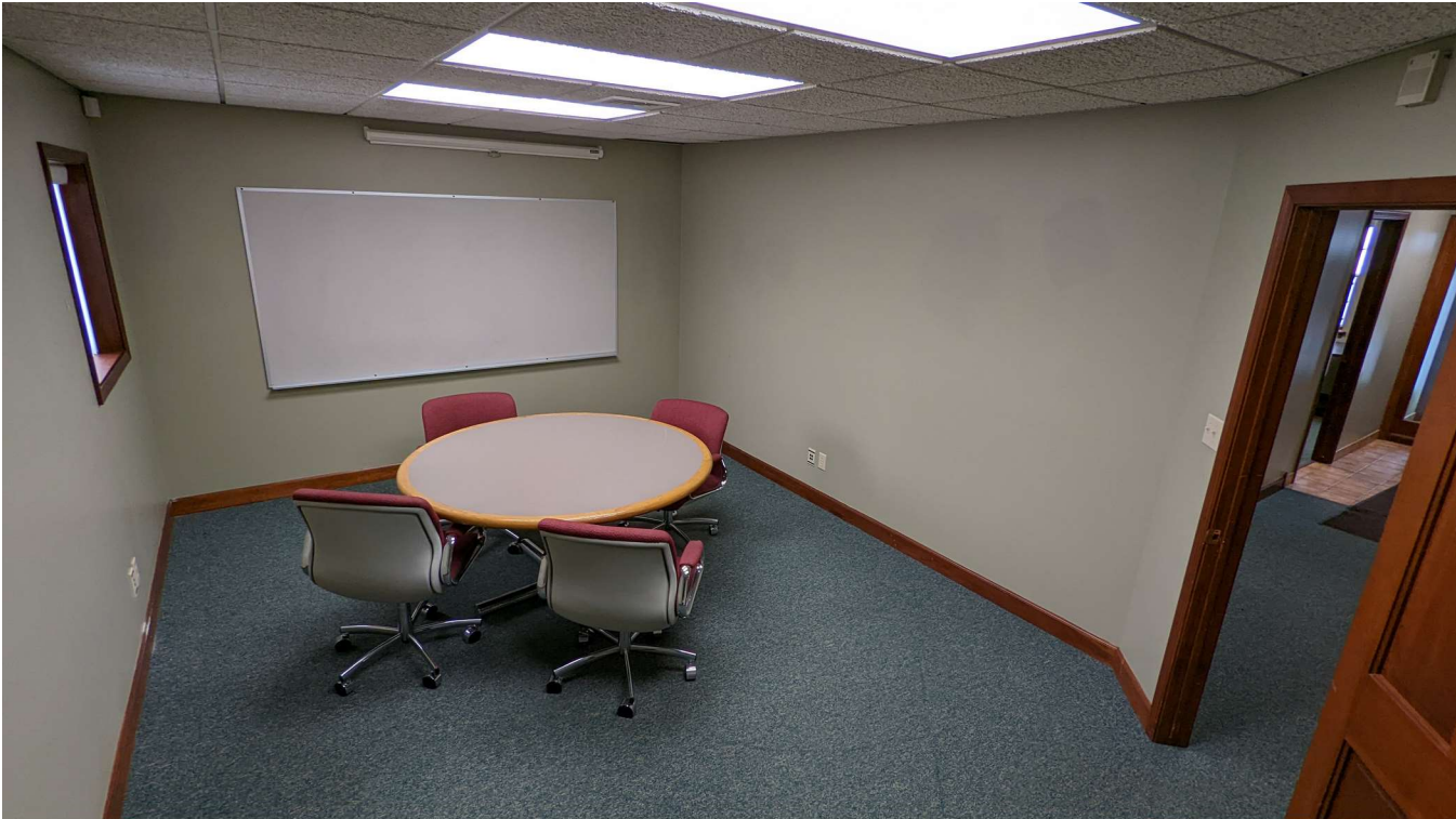
Lower Private Office-Conference Room