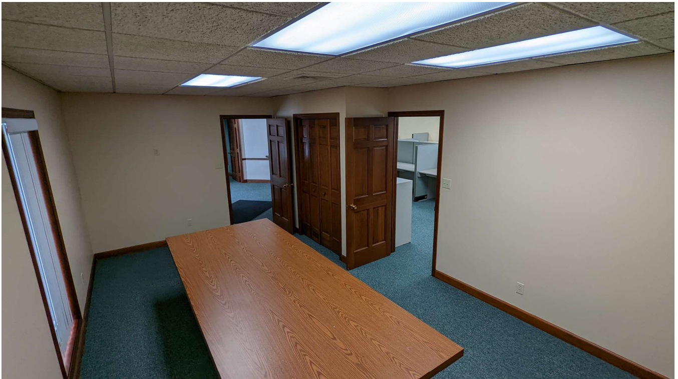
Upper Private Office - Conference Room