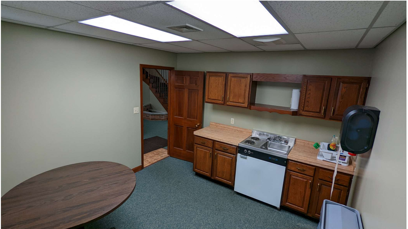
Lower Kitchen & Break Room