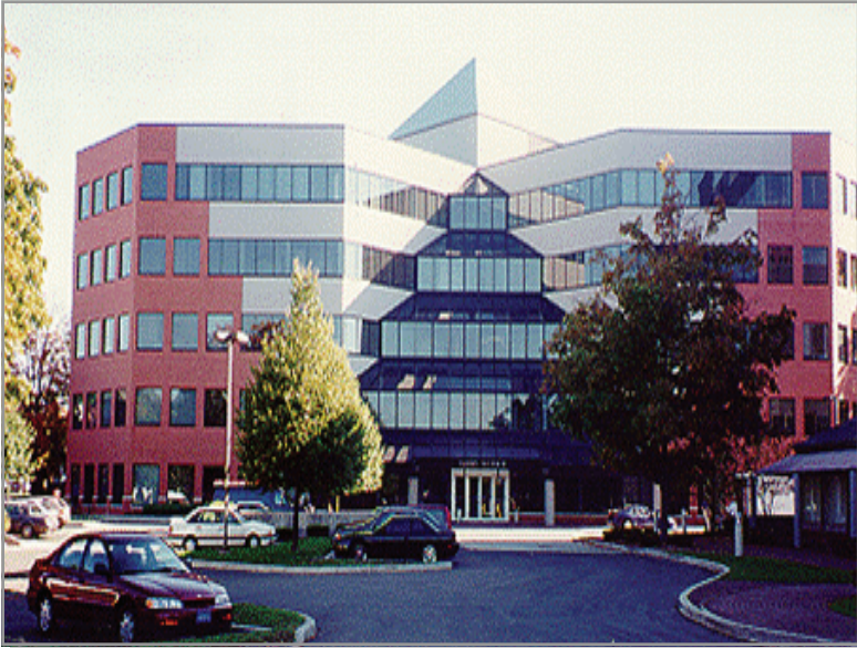
Available Fifth Floor 5,592 RSF