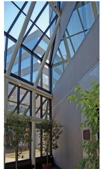
Views of Lobby