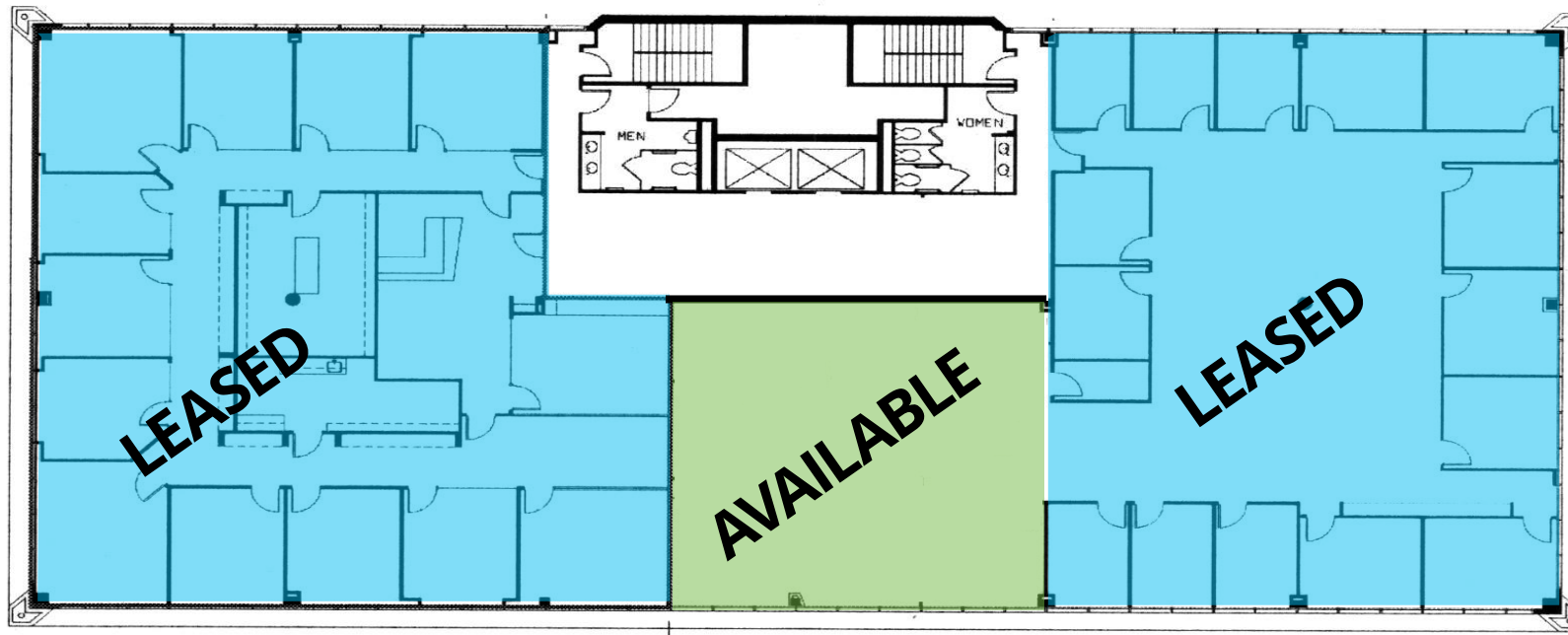
Suite 405 - 1,761 SF