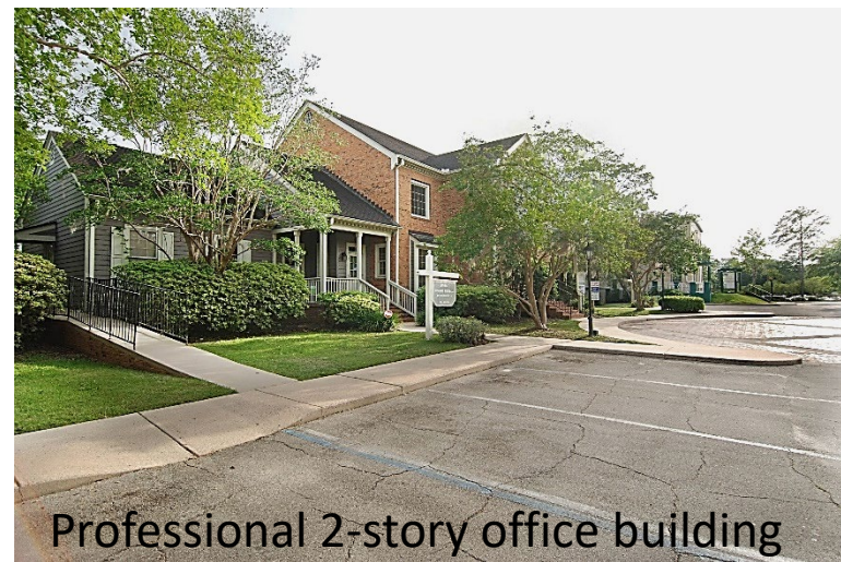
Professional 2-story office building