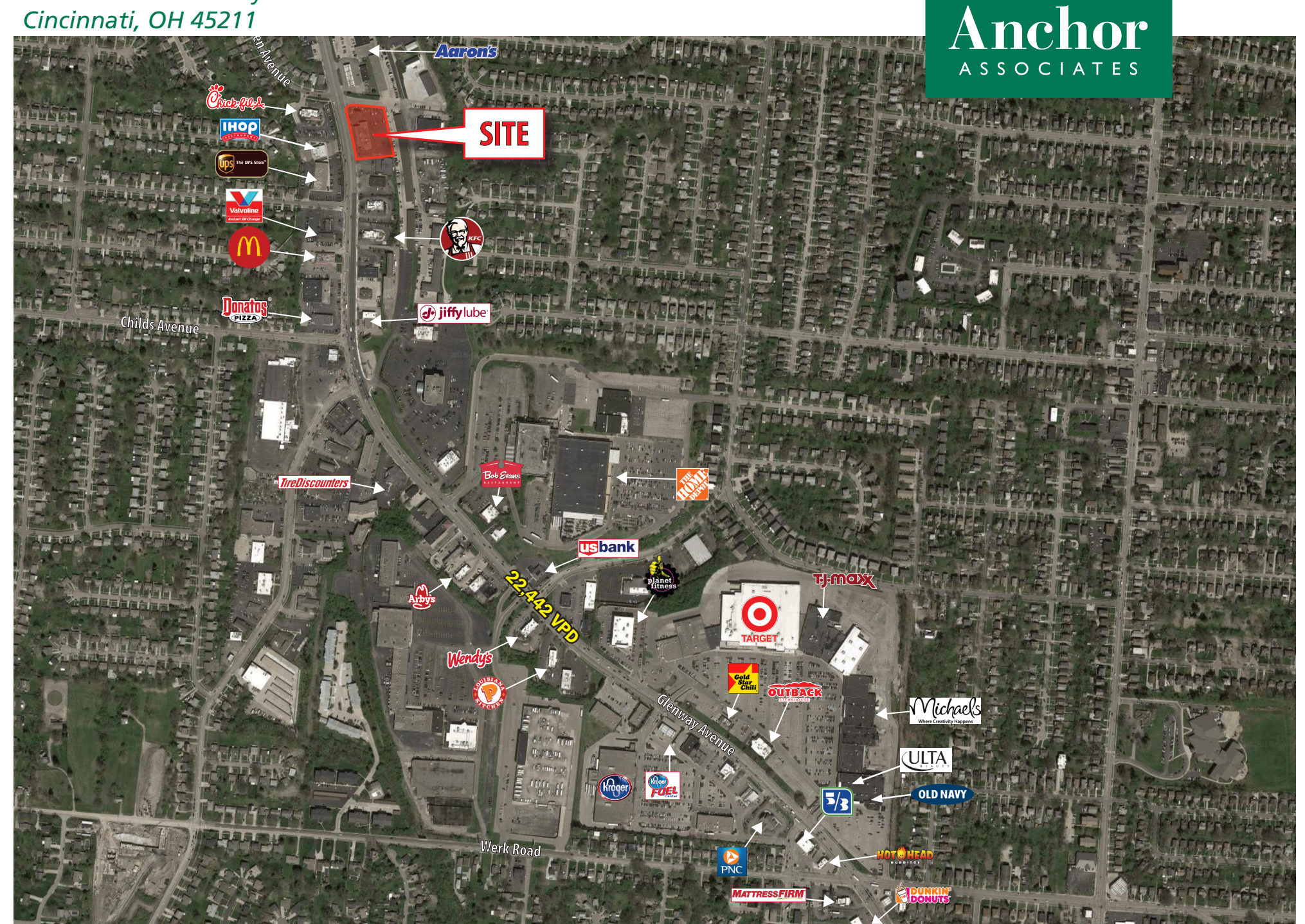
The information herein is not guaranteed. Although obtained from reliable sources, it is subject to errors, omissions and withdrawal from the market without notice.

6490 & 6496 Glenway Avenue Cincinnati, OH 45211