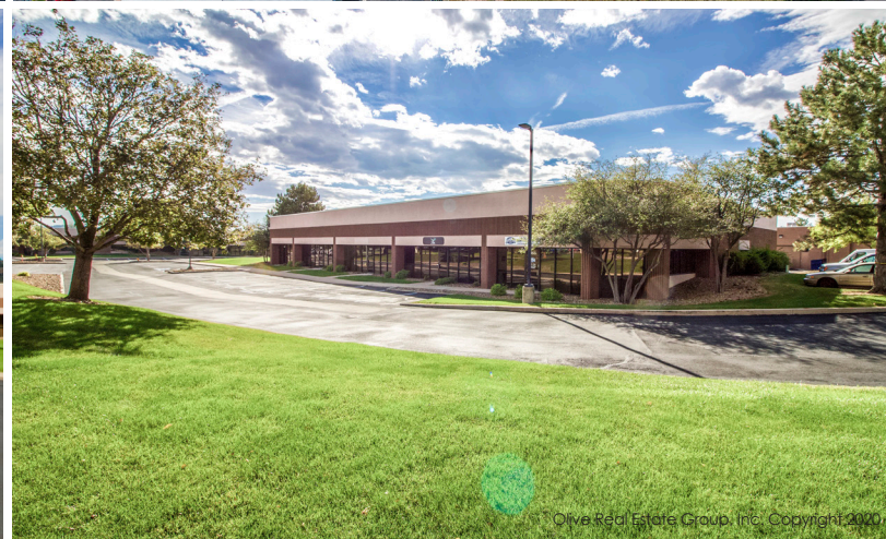
Olive Real Estate Group, Inc. Copyright 2020