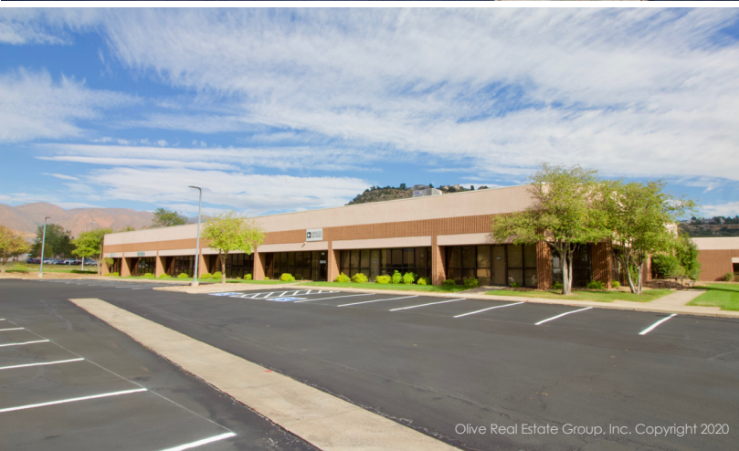
Olive Real Estate Group, Inc. Copyright 2020