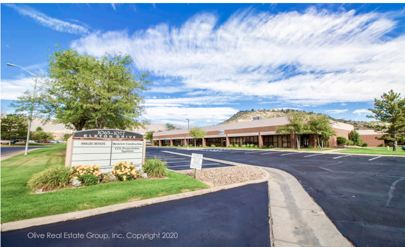
Olive Real Estate Group, Inc.