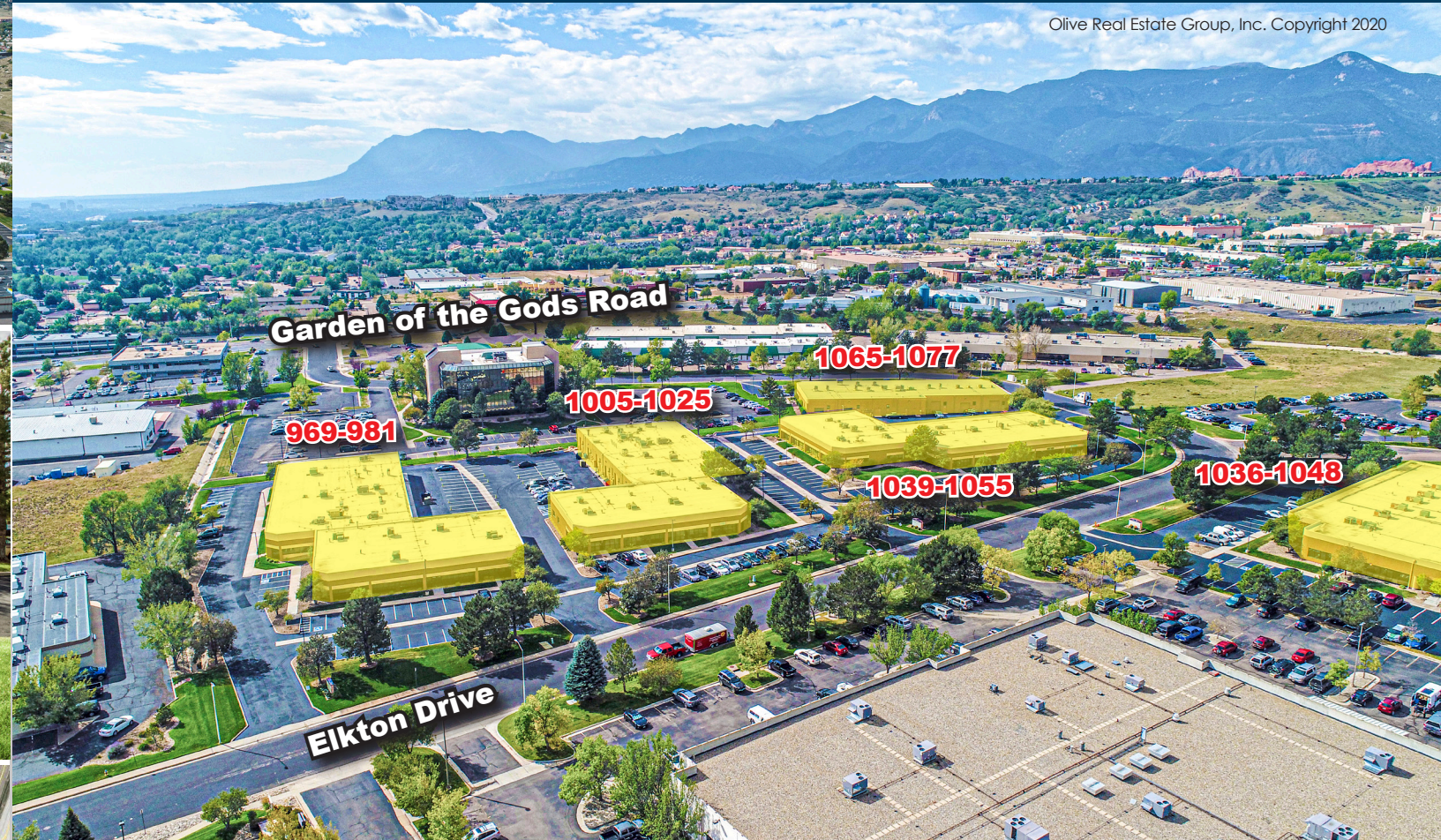
Olive Real Estate Group, Inc. Copyright 2020

FOR LEASE GARDEN OF THE GODS INDUSTRIAL PARK 967-1077 & 1036-1050 ELKTON DRIVE, COLORADO SPRINGS, CO 80907