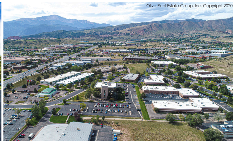
Olive Real Estate Group, Inc. Copyright 2020