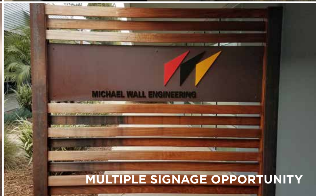
MULTIPLE SIGNAGE OPPORTUNITY