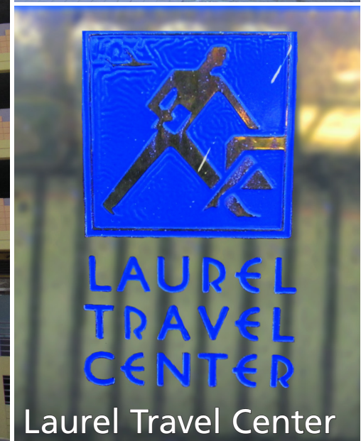
Laurel Travel Center