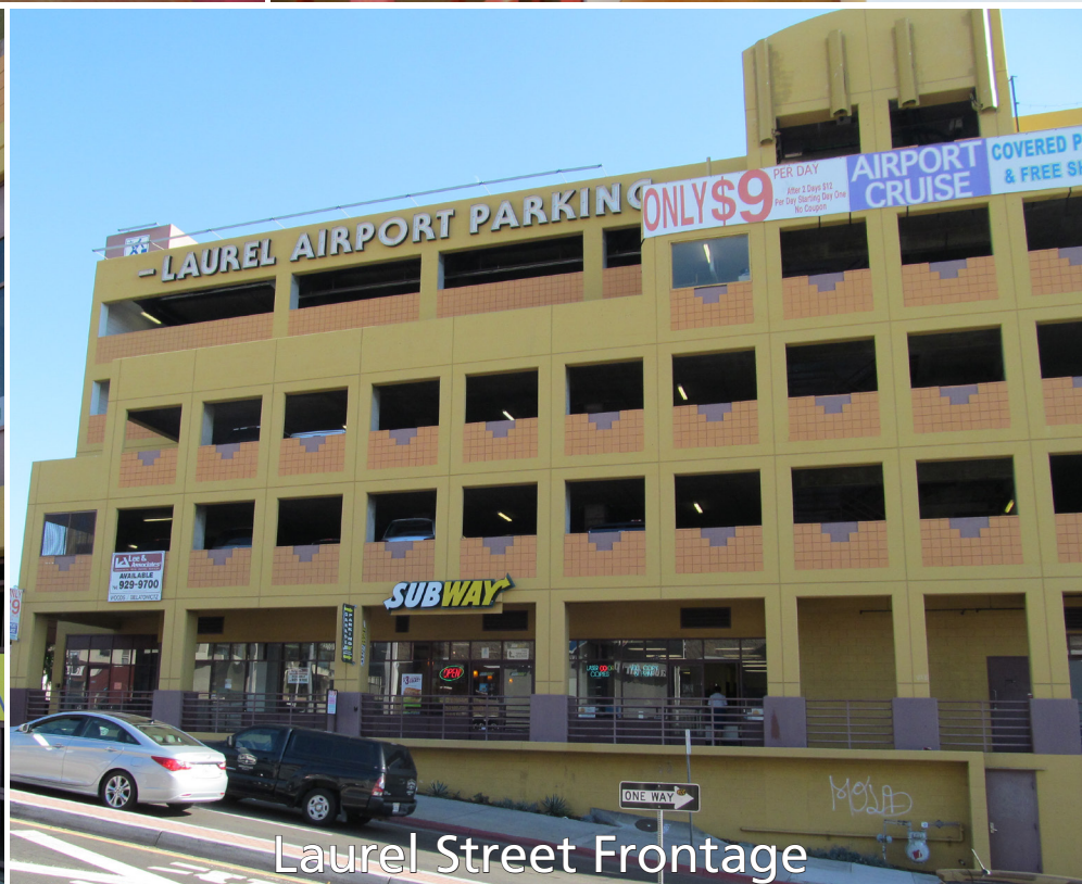
Laurel Street Frontage