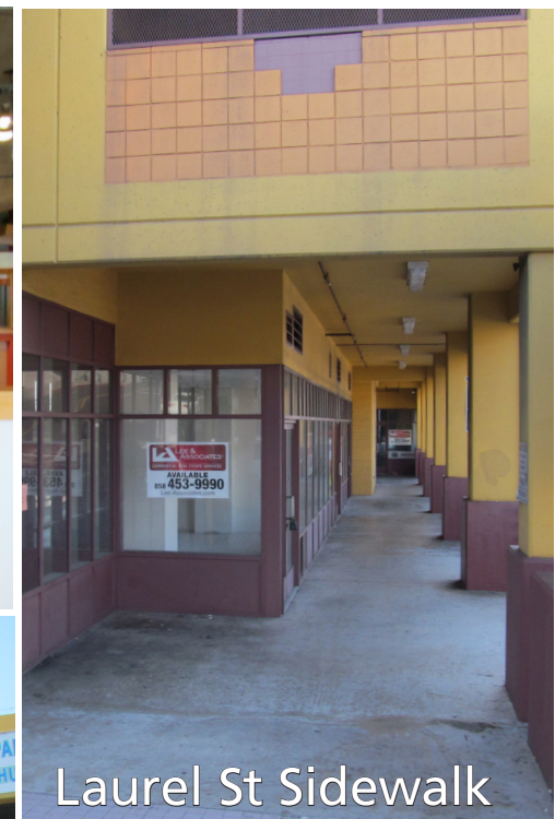
Laurel St Sidewalk