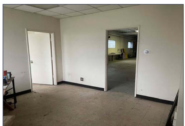
Front office area