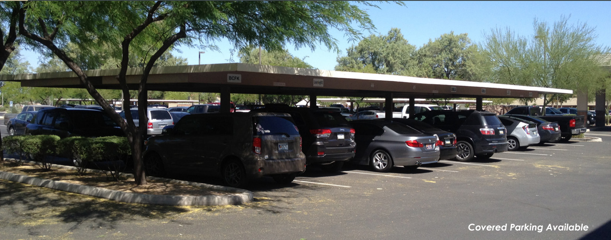
Covered Parking Available