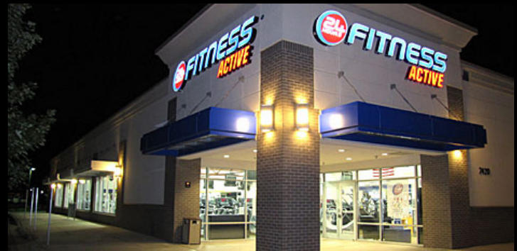
Actual Property Photo

The Property serves a trade area featuring one of metropolitan Kansas City's strongest demographic profiles. The trade area includes the communities of Overland Park and Leawood, as well as a portion of Lenexa, Olathe, Prairie Village, and the southwest corner of Kansas City. Within a three-mile radius are over 79,700 residents with an average household income of $104,785 and a median household income of $73,675. The area's population is expected to grow 4.0% over the next five years.