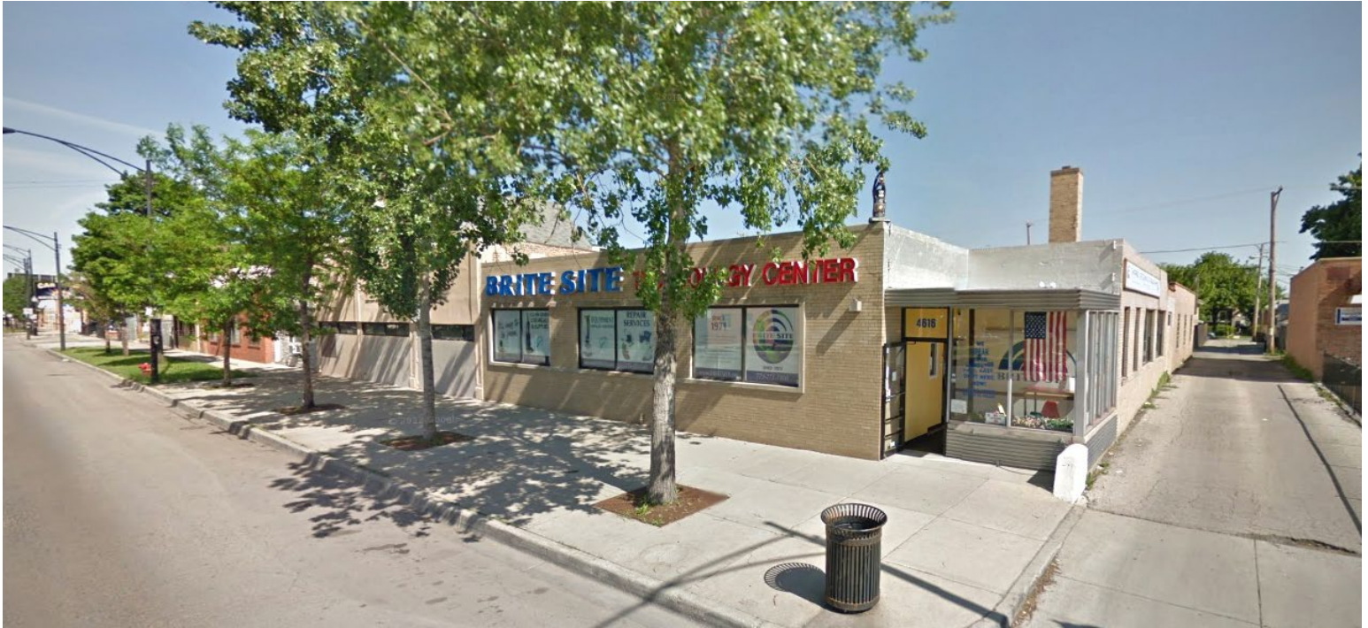
Streetview from W. Fullerton Ave.

4616 W. Fullerton Avenue CHICAGO, IL 60639