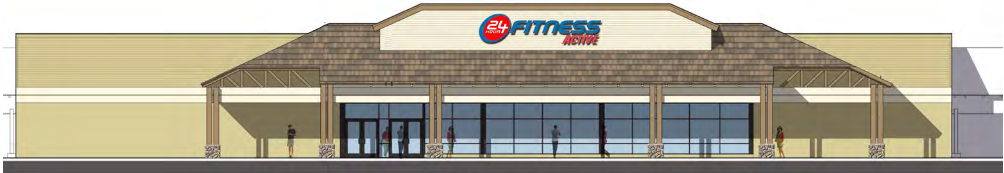
ELEVATION SOUTH - FITNESS