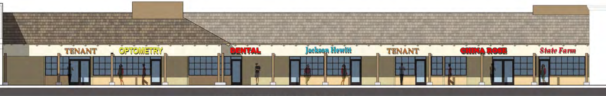
ELEVATION SOUTH - SHOPS 2