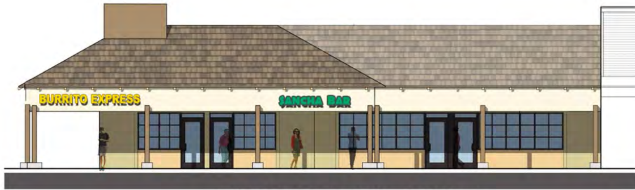
ELEVATION SOUTH - SHOPS 1