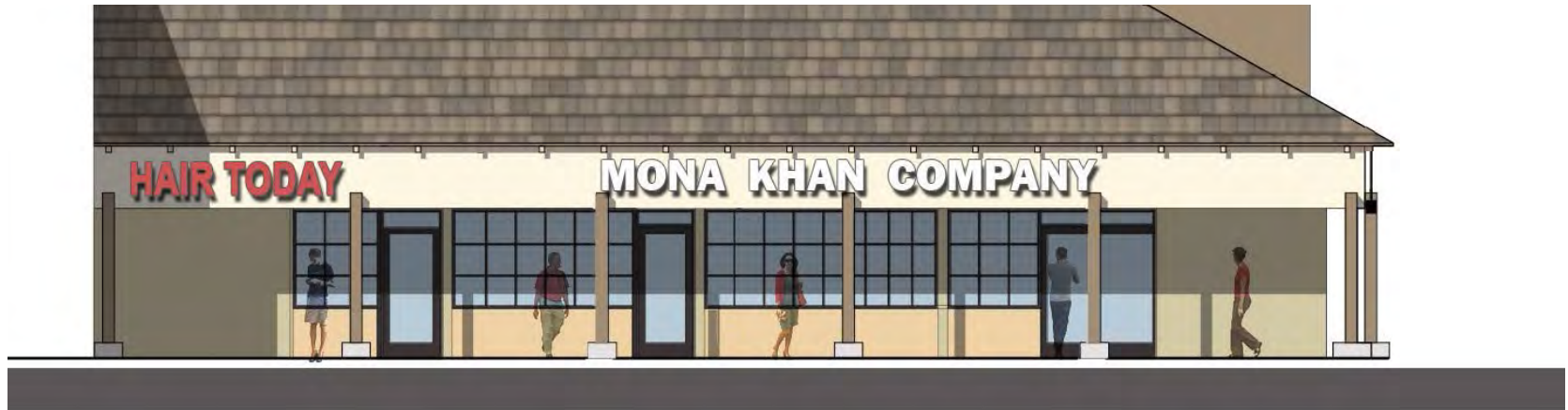
ELEVATION SOUTH - SHOPS 3