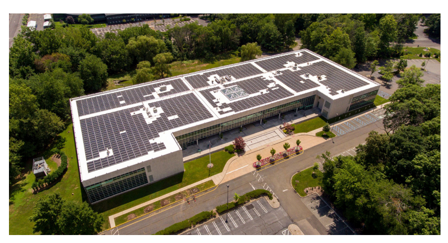
New Solar Rooftop Panels