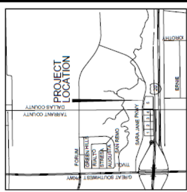
VICINITY MAP SCALE 1" = 100'