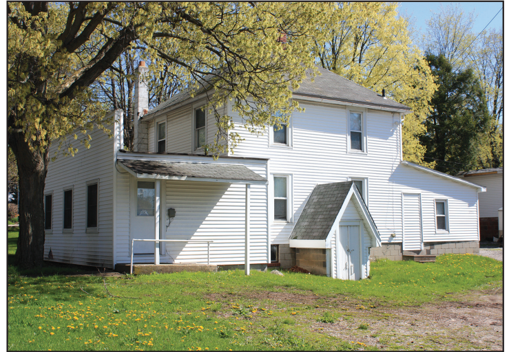
Duplex pictured, generating $1,150 of additional monthly income

Located in a great location, North East quadrant of Sharon Center Circle, SR 94 & 162, 4 miles North of I-76