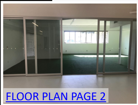
FLOOR PLAN PAGE 2