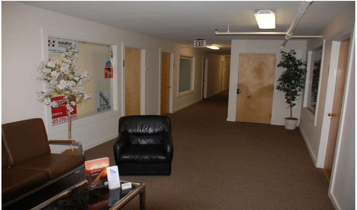
Common Waiting Area