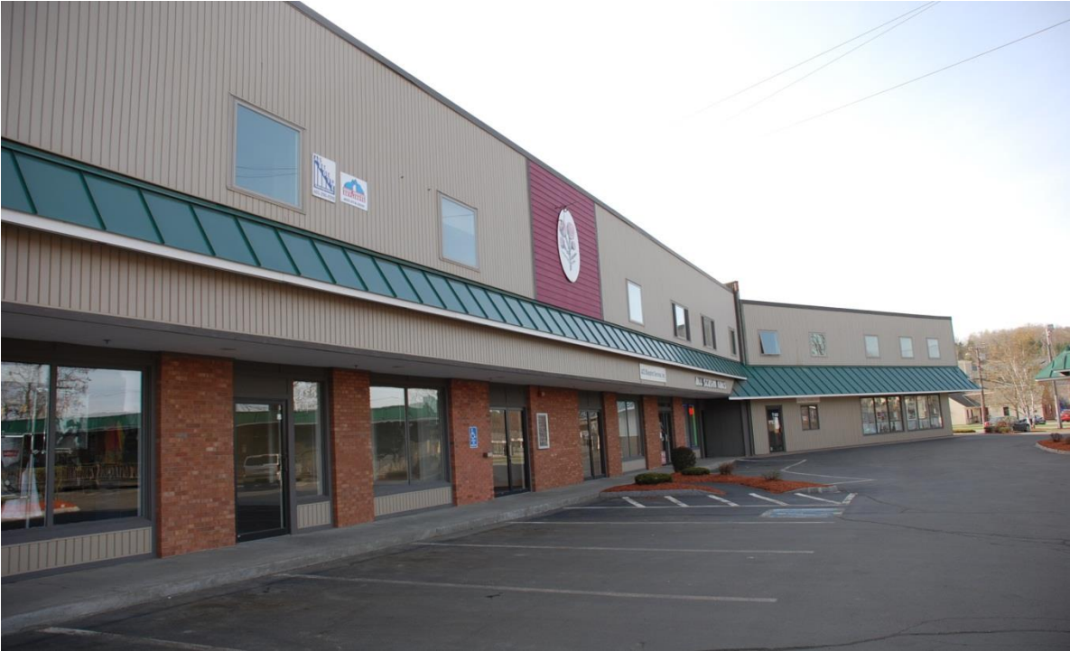
Typical Second Floor Office Locations