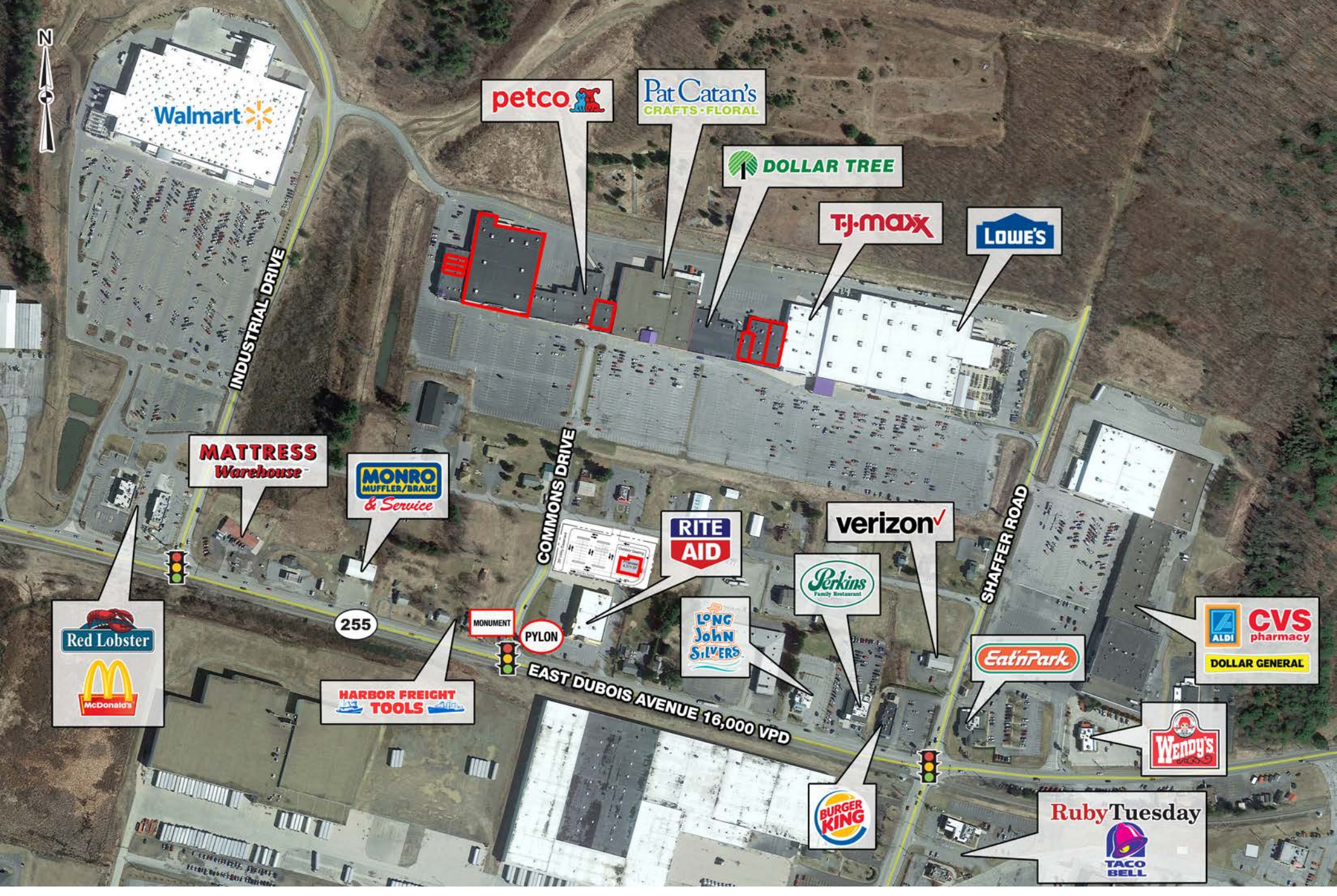
The information and images contained herein are from sources deemed reliable. However, Metro Commercial Real Estate, Inc. makes no representation whatsoever as to their accuracy or authenticity. Images shown may be modified for illustrative purposes. Images may be out-of-date and not current. 2.27: