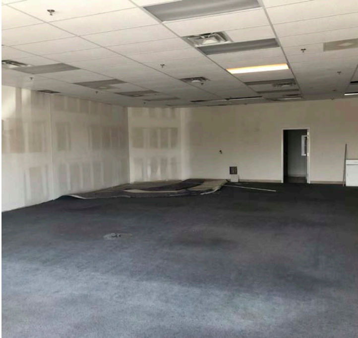
Suite B-10: 2,176 SF