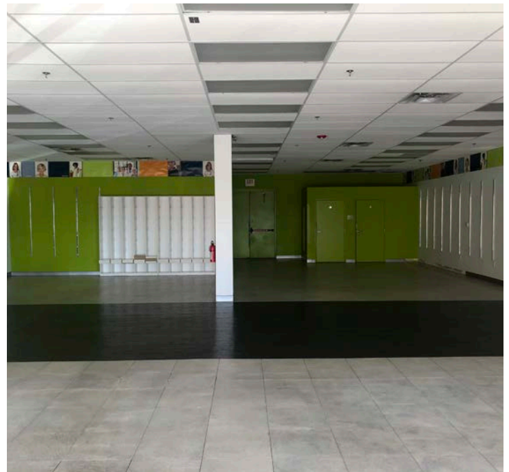
Suite B-14: Interior Endcap - 2,400 SF