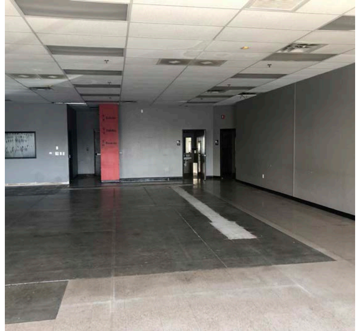
Suite B-11: Former Karate Studio - 2,138 SF