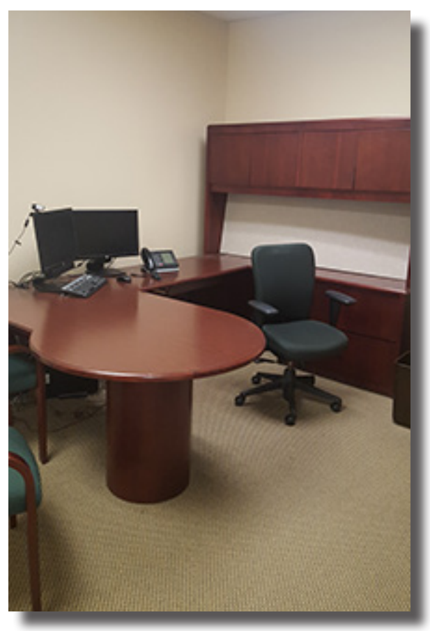
Information contained herein has been obtained from the owners of the property or from other sources that we deem reliable. We have no reason to doubt its accuracy, but do not guarantee it.