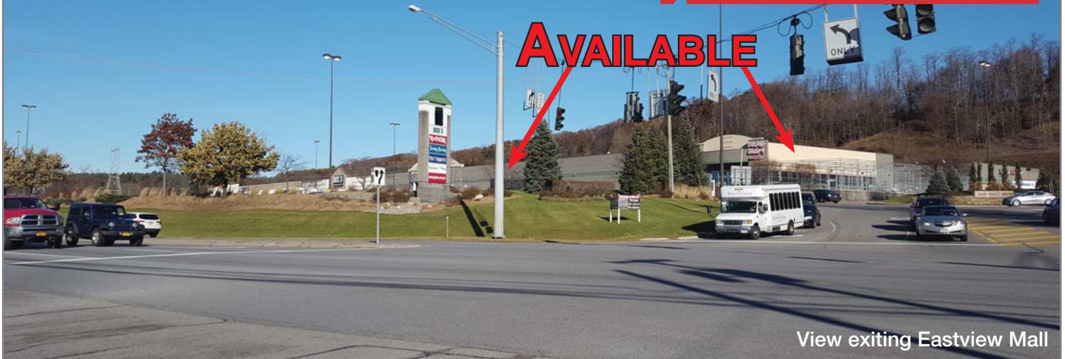
View exiting Eastview Mall

Cobblestone Court Across from Eastview Mall Victor, NY