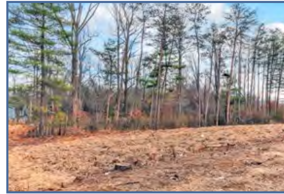
Lot No. 10 on Christel Lane, Asheville Airport Plaza

Location is everything, and the Arden/Fletcher zone has great potential for continued growth.