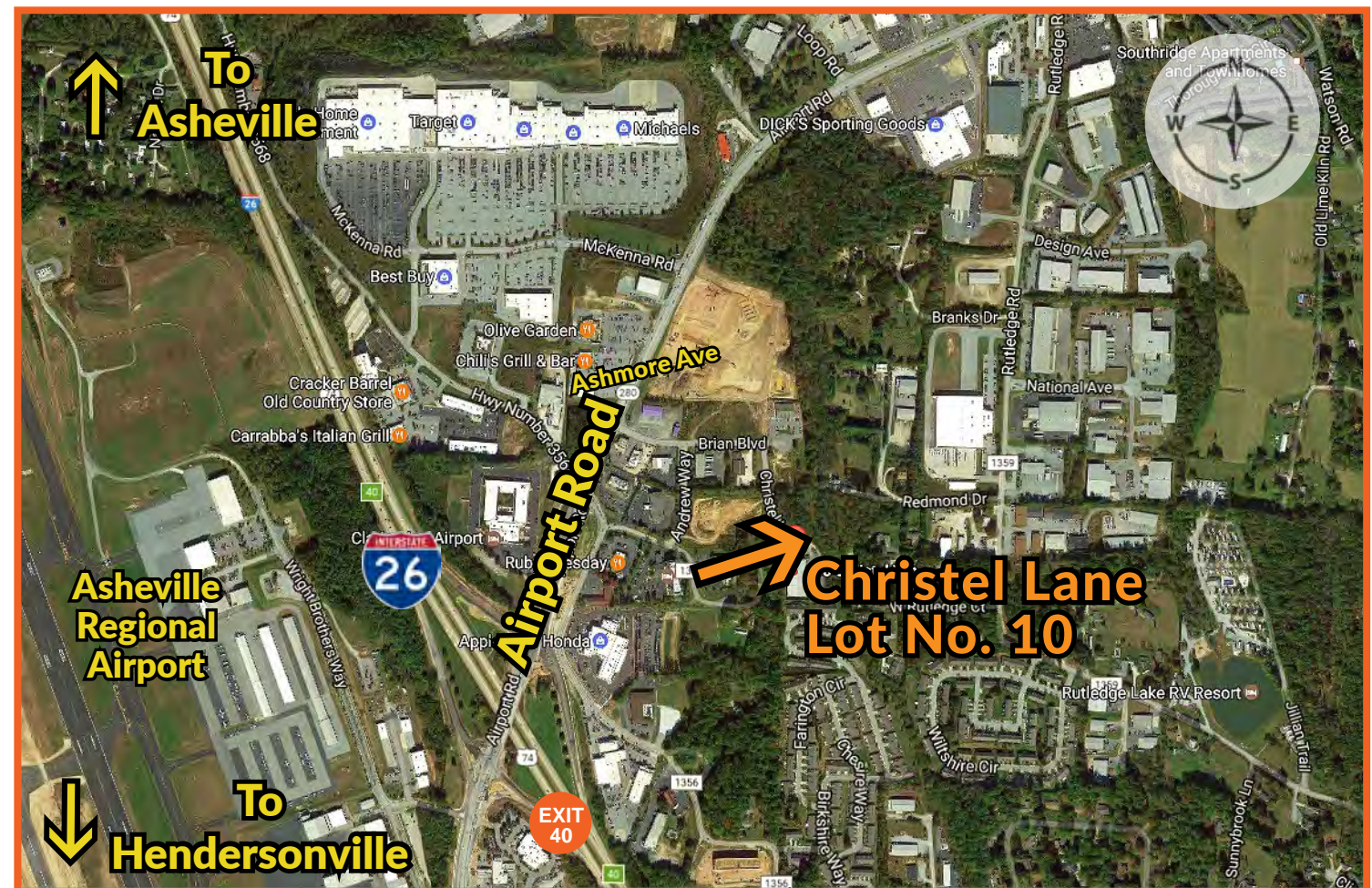
Aerial of Lot No. 10 in Asheville Airport Plaza, showing proximity to Airport and I-26.

Hampton Inn & Suites Econo Lodge Courtyard by Marriott Wingate by Wyndham Clarion Inn Fairfield Inn Comfort Inn Budget Inn Knight's Inn