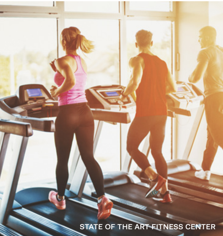
STATE OF THE ART FITNESS CENTER