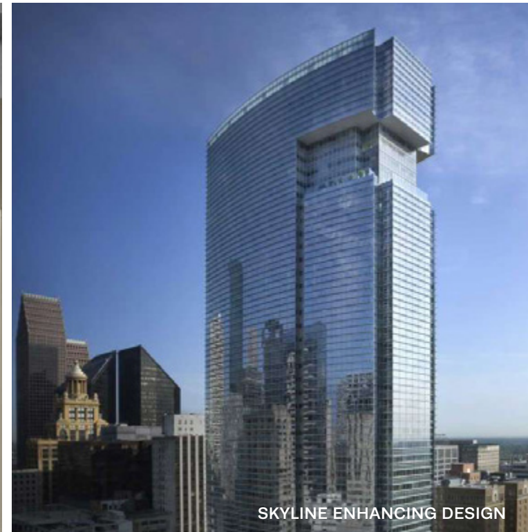
SKYLINE ENHANCING DESIGN