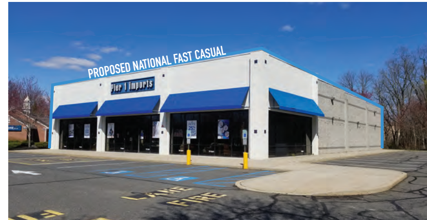
± 8,984 SF - PROPOSED NATIONAL FOOD CASUAL