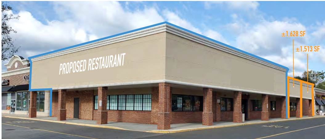
± 7,542 SF - PROPOSED RESTAURANT