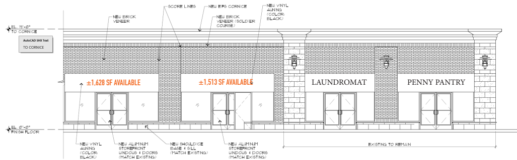
02 PROPOSED FRONT ELEVATION SCALE: 3/16" = 1'-0"