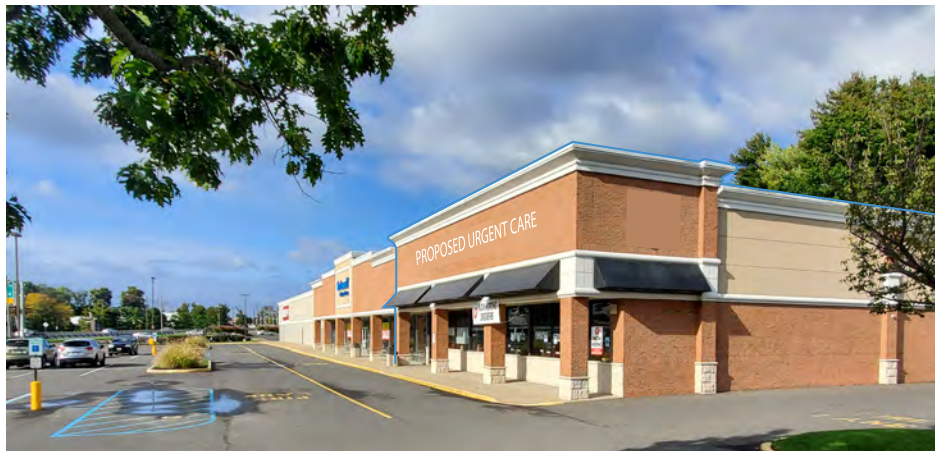
± 4,800 SF - PROPOSED URGENT CARE