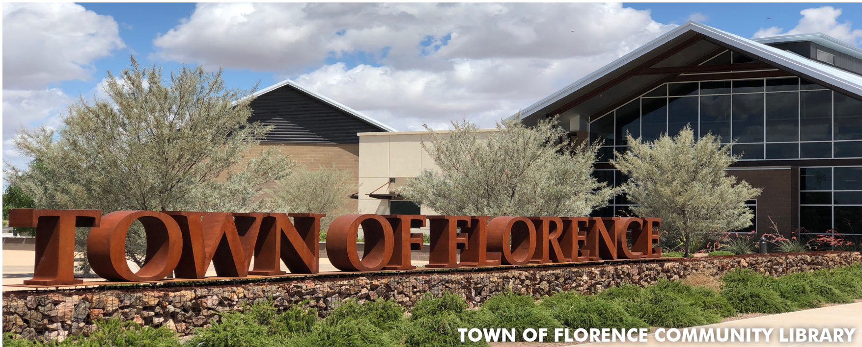
TOWN OF FLORENCE COMMUNITY LIBRARY

The Town of Florence is one of the oldest incorporated towns in Arizona, with a rich and unique history. The town provides a secluded feel, but is approximately a 45-minute drive to both Phoenix and Tucson.