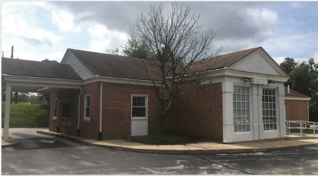
*DEMOGRAPHICS BASED ON A 5-MILE RADIUS