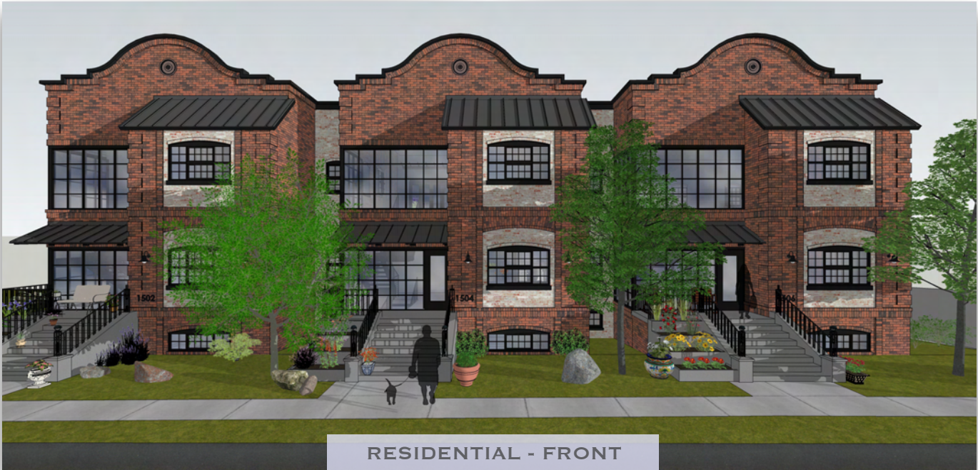
RESIDENTIAL - FRONT