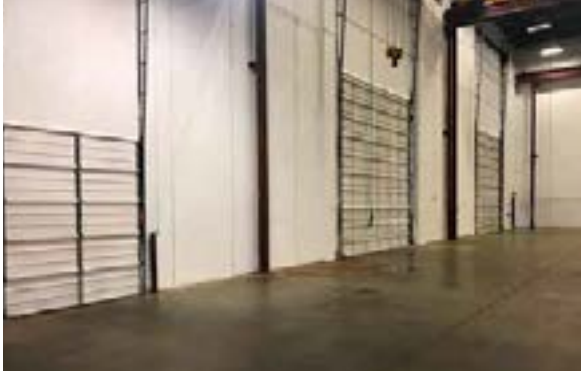
161,229 SF MANUFACTURING/PRODUCTION BUILDING