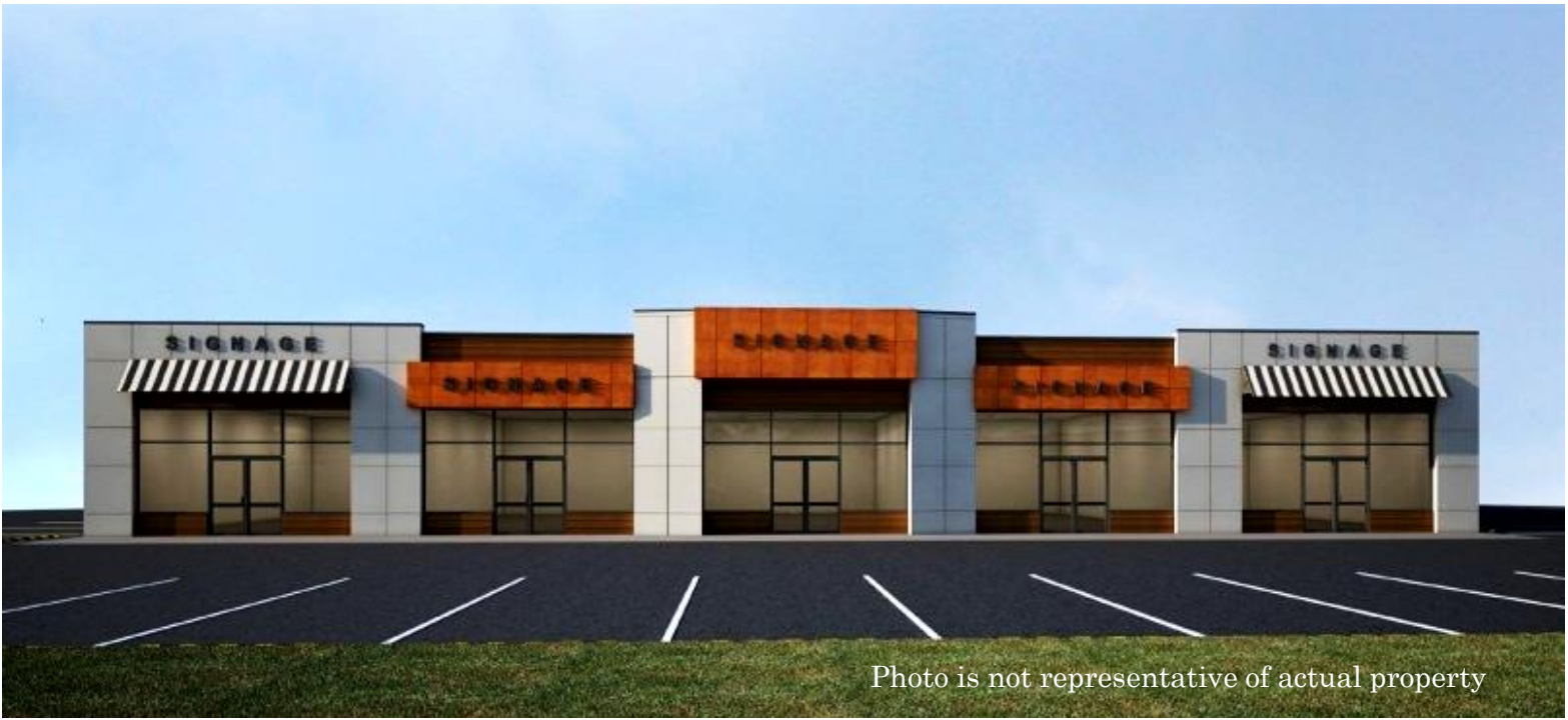
Photo is not representative of actual property