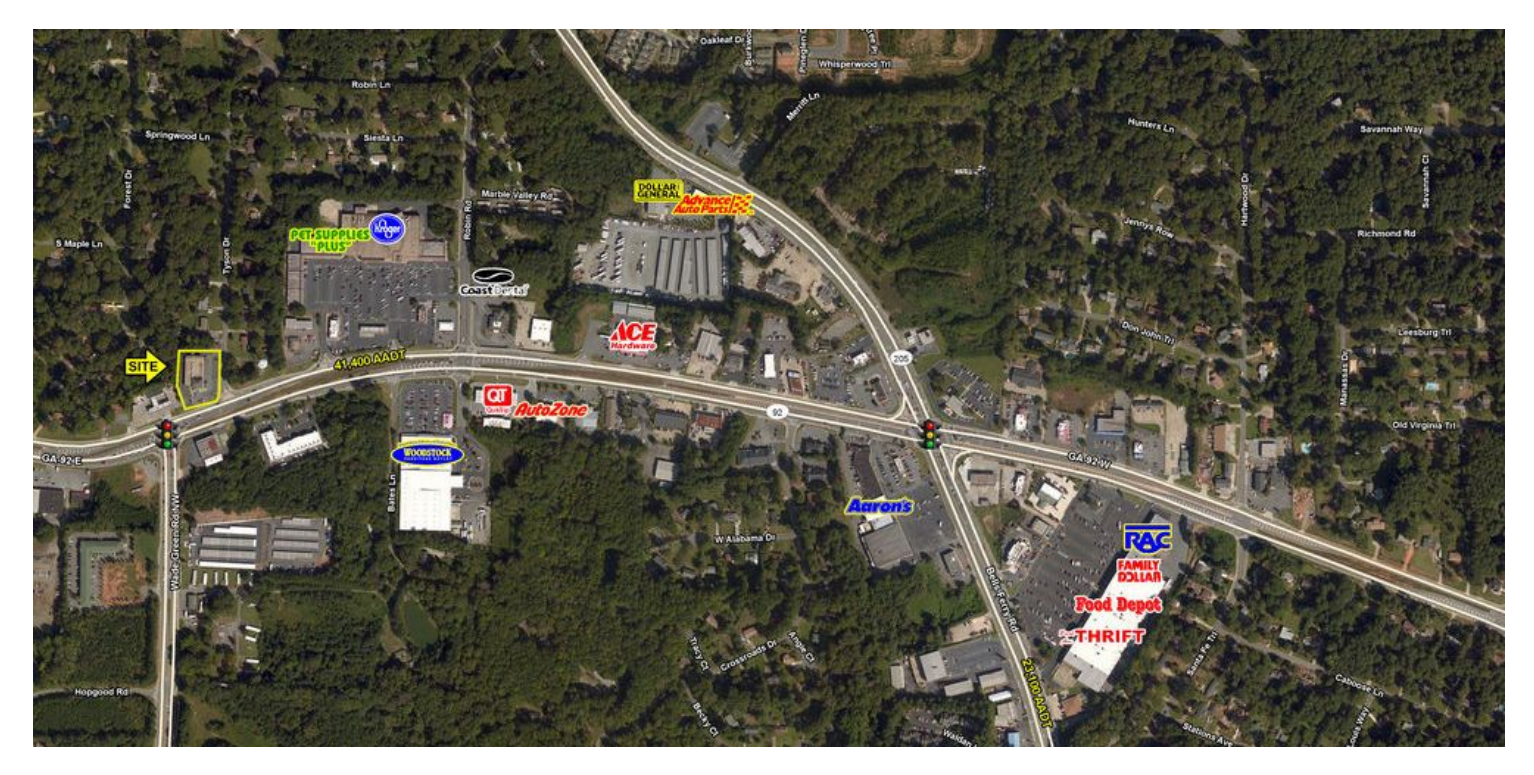
LOCATION OVERVIEW NEC of Hwy 92 & Wade Green Rd NW