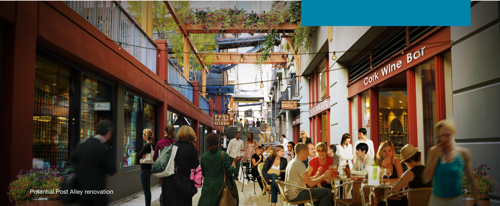
Potential Post Alley renovation