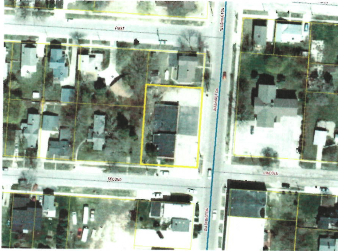
2013 Digital Orthophotos (Aerial Photographs)

The digital orthophotos (aerial photographs) displayed were acquired spring of 2013 with "leaf-off" conditions. The county-wide imagery consists of .5' (6 inch) pixel resolutions. Please contact Manistee County Equalization to obtain these digital images and/or detailed prints/maps of selected locations through-out Manistee County.