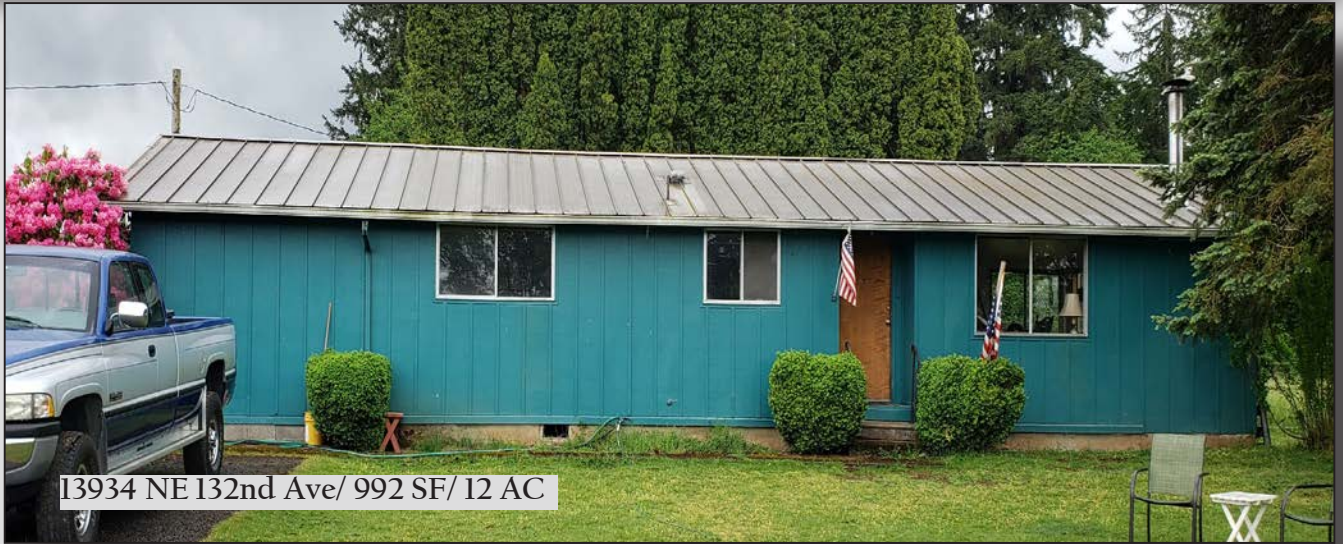
13934 NE 132nd Ave/ 992 SF/ 12 AC