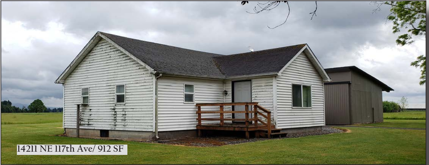
14211 NE 117th Ave/ 912 SF