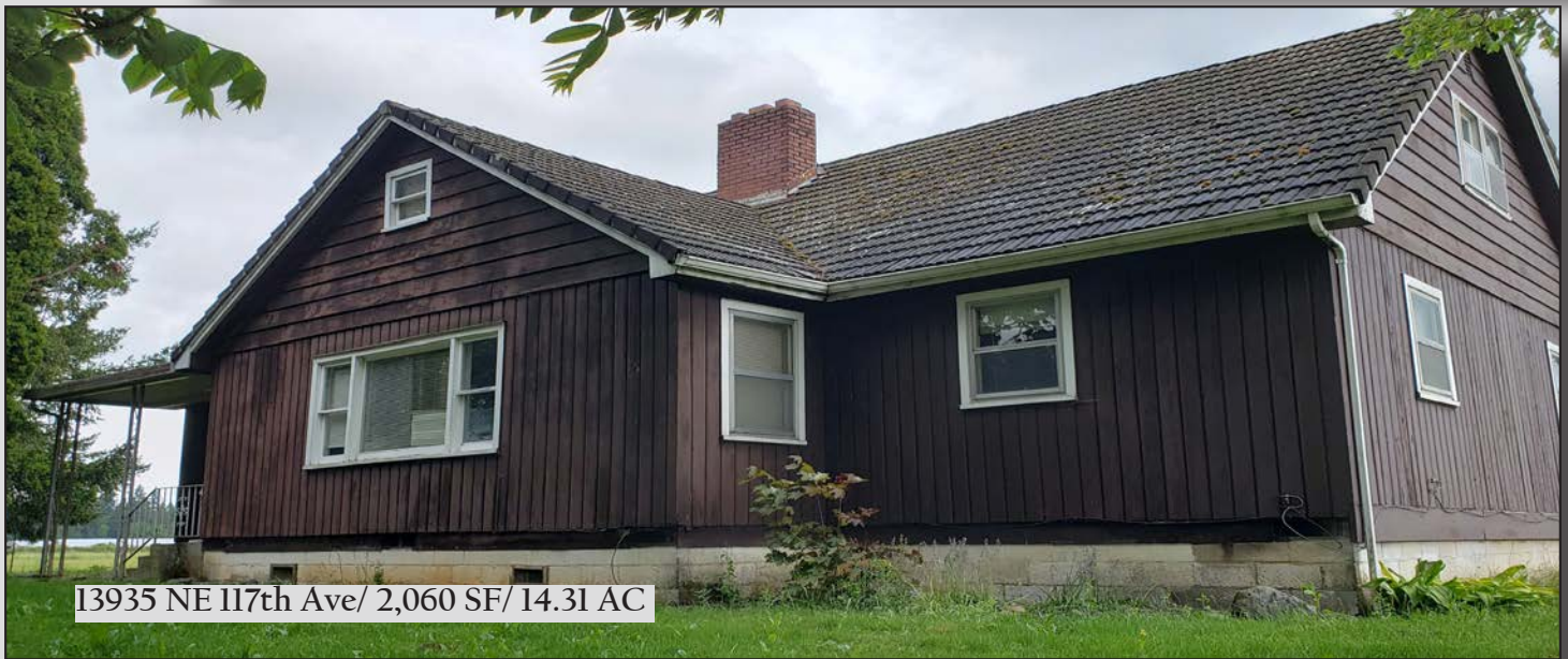
13935 NE 117th Ave/ 2,060 SF/ 14.31 AC