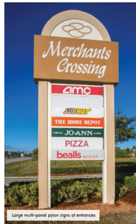
Large multi-panel pylon signs at entrances