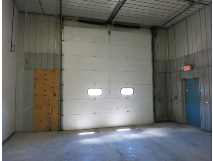
14' overhead door