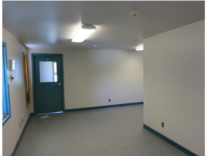
New front office