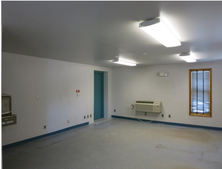
Front office area