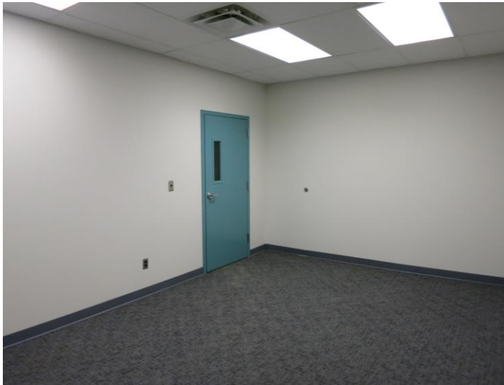
New 12' x 18' office