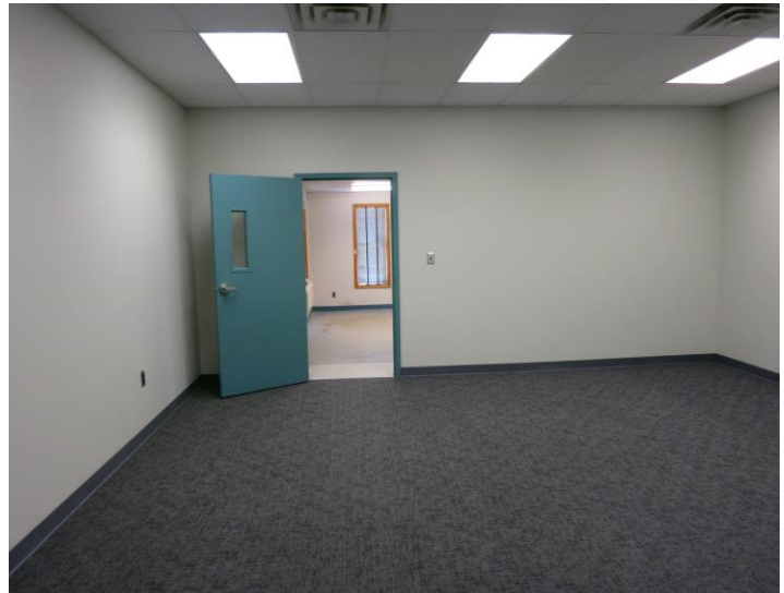
New 18' x 18' office