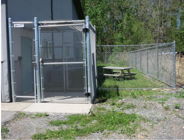
New fenced side yard