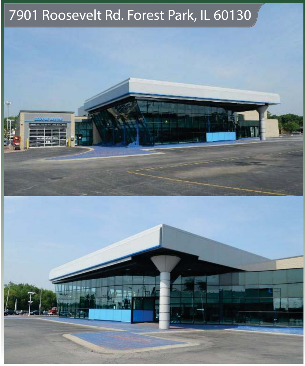
Forest Park, I

Forest Park is a village in Cook County, a suburb of Chicago. The Forest Park train stop on the CTA Blue Line is the line's western terminus, located on the Eisenhower Expy. at Des Plaines Ave. Approximately 10 miles west from Chicago's downtown loop area, Forest Park combines the unlimited resources of an urban setting with a small town sense of community, making it an exceptional place in which to live, work and do business. Forest Park boasts first class dining at any number of fine eateries and pubs, and plays host to a variety of regionally attended events every year. Crowned "The best in neighborhood dining" according to a 2008 Chicago Tribune readers poll, the variety of Forest Park restaurants offer something for everyone.