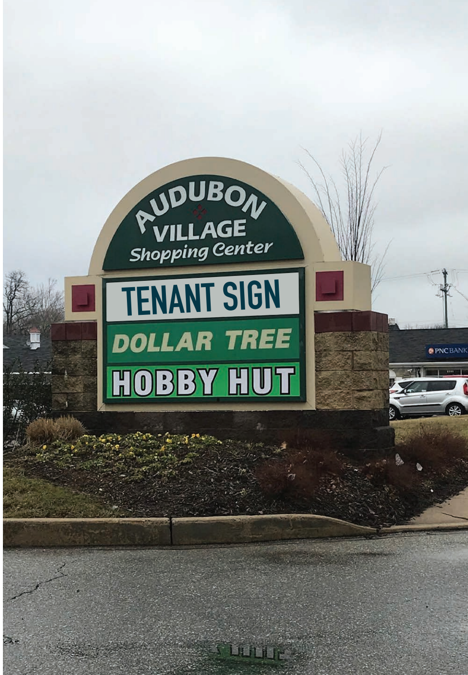
The information and images contained herein are from sources deemed reliable. However, Metro Commercial Real Estate, Inc. makes no representation whatsoever as to their accuracy or authenticity. Images shown may be modified for illustrative purposes. Images may be out-of-date and not current. 7.25.18