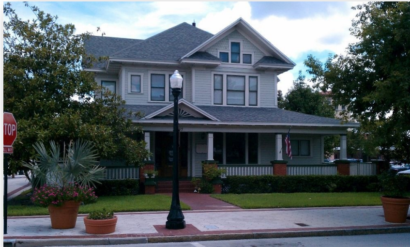
255 N. Kentucky Avenue, Lakeland, Florida