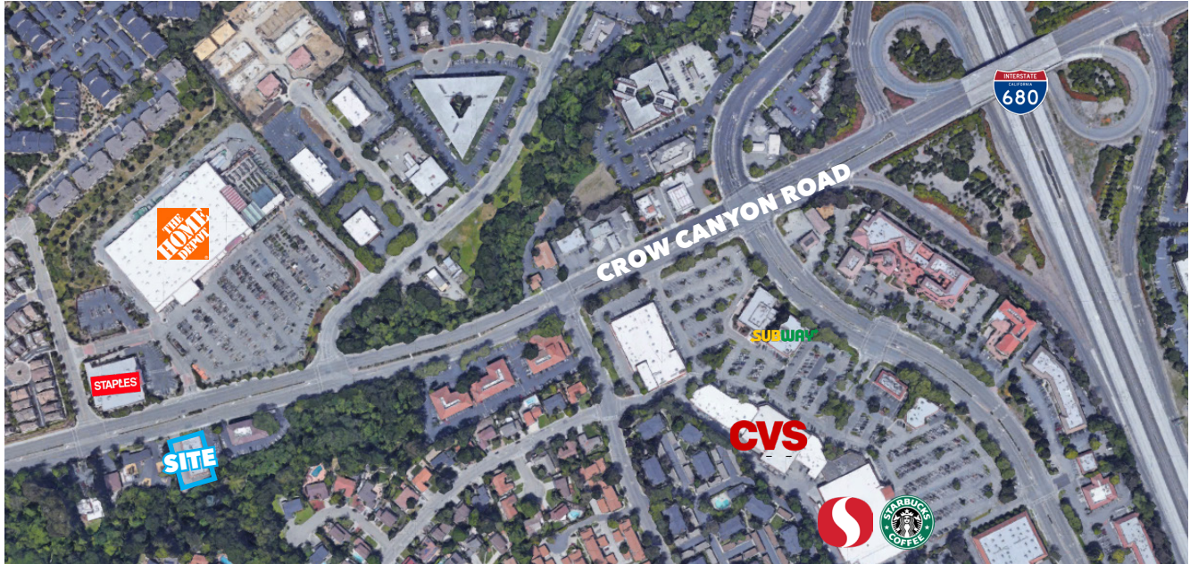
2701 Crow Canyon Road Suite C2