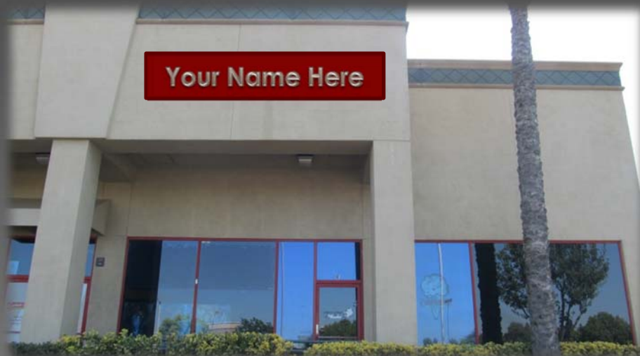
Front of Space