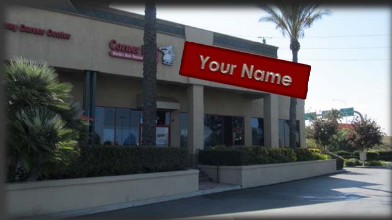
Sits along the 15 Freeway