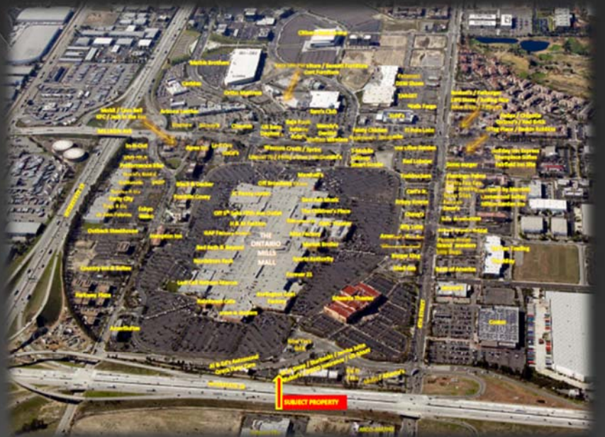
Aerial of Location