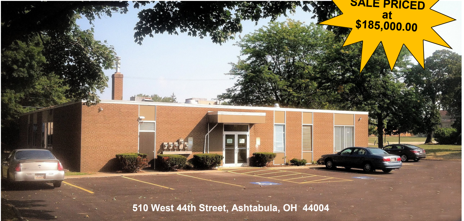
510 West 44th Street, Ashtabula, OH 44004