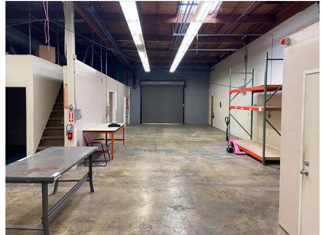
1067 HENSLEY INTERIOR