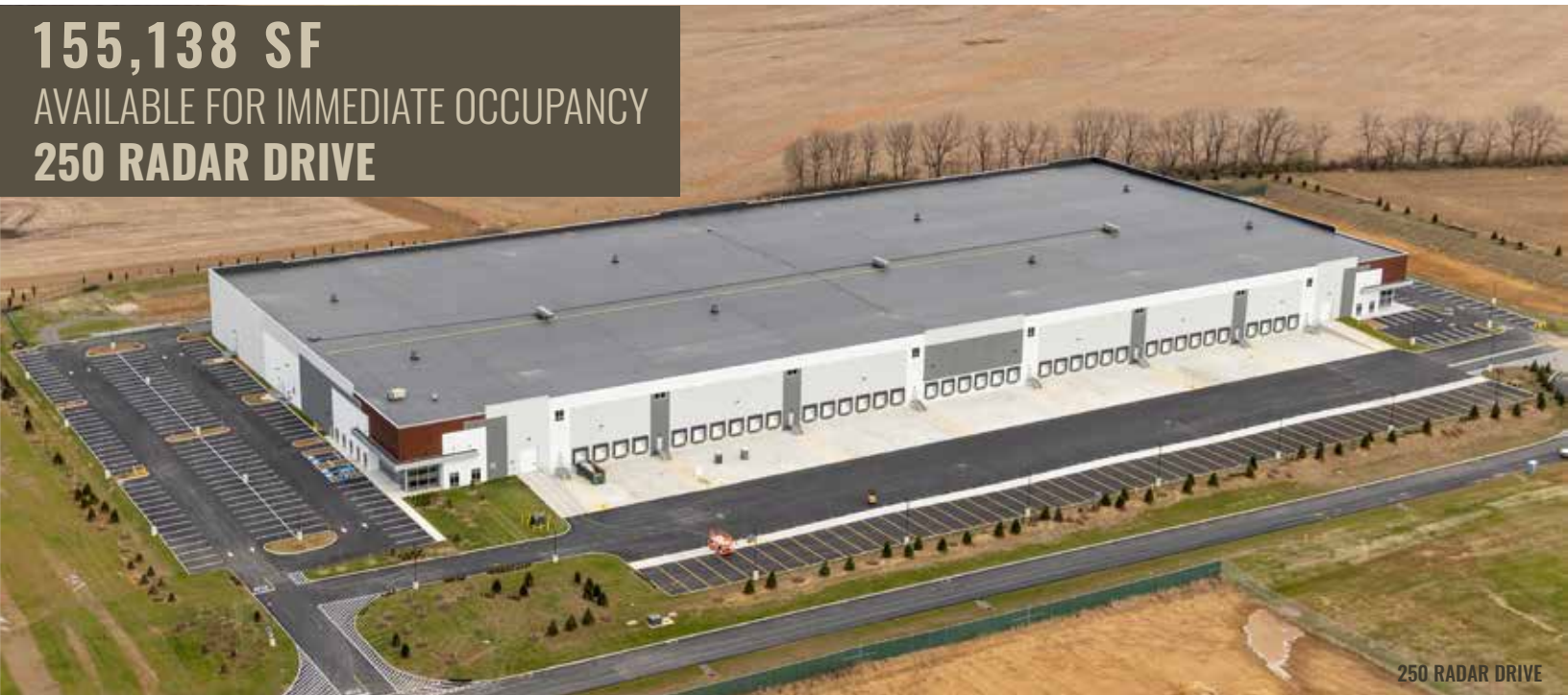
250 RADAR DRIVE

155,138 SF AVAILABLE FOR IMMEDIATE OCCUPANCY 250 RADAR DRIVE