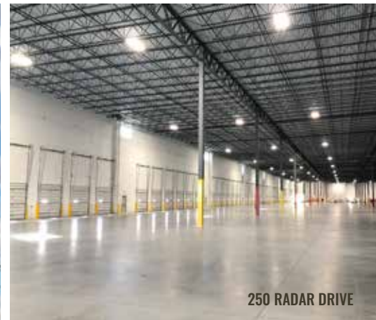
250 RADAR DRIVE