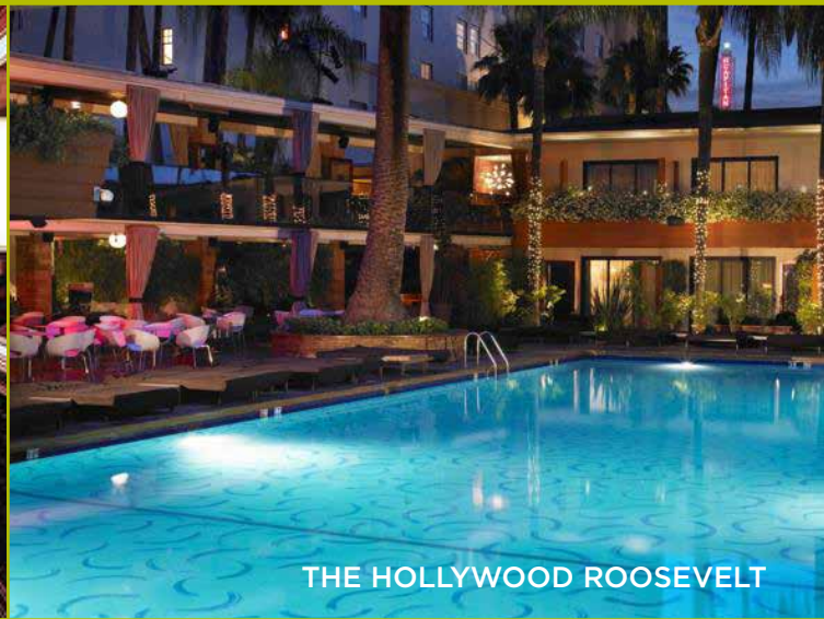
THE HOLLYWOOD ROOSEVELT