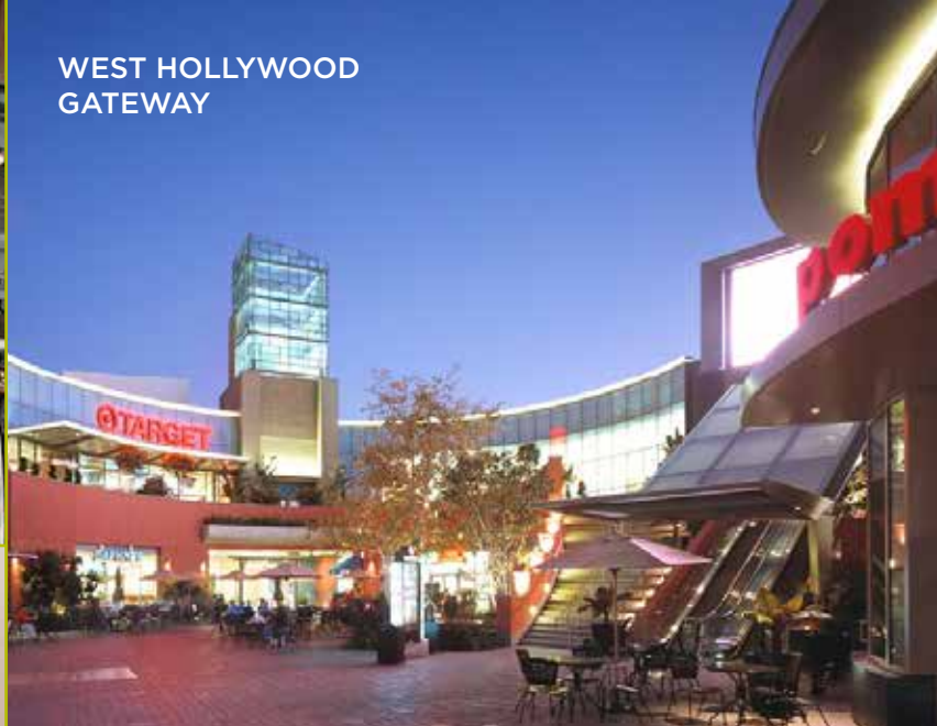
WEST HOLLYWOOD GATEWAY