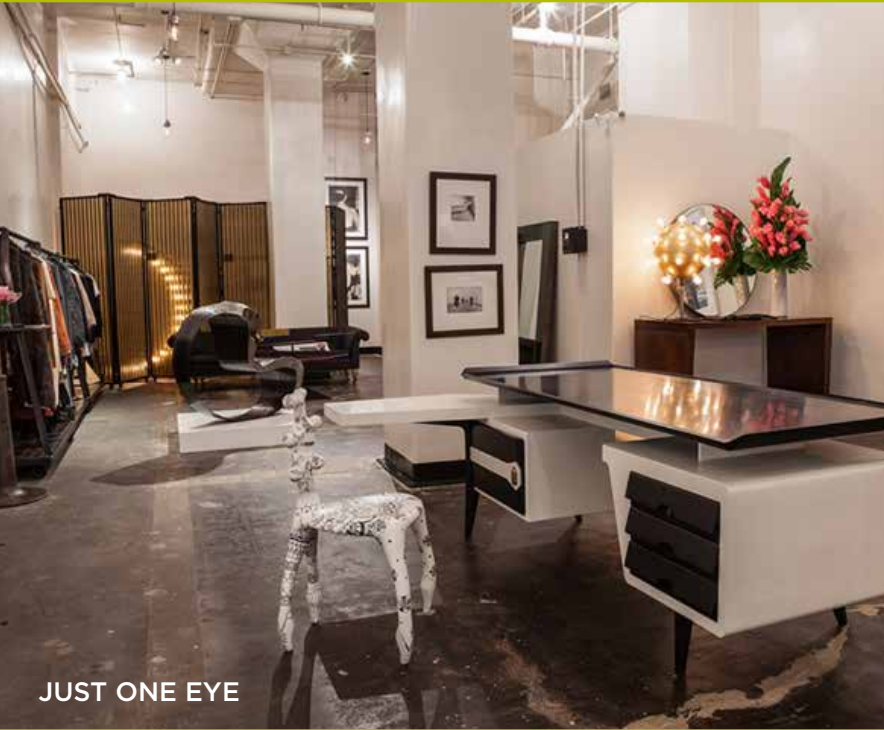
JUST ONE EYE