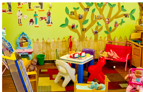
On-site day care