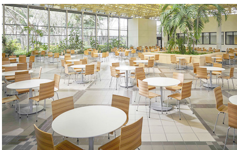
Bistro Cafe: 1,200-seat dining hall