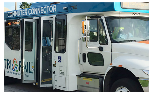
Private Tri-Rail Shuttle