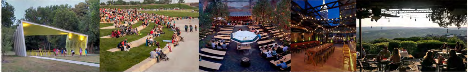
DINING AND ENTERTAINMENT